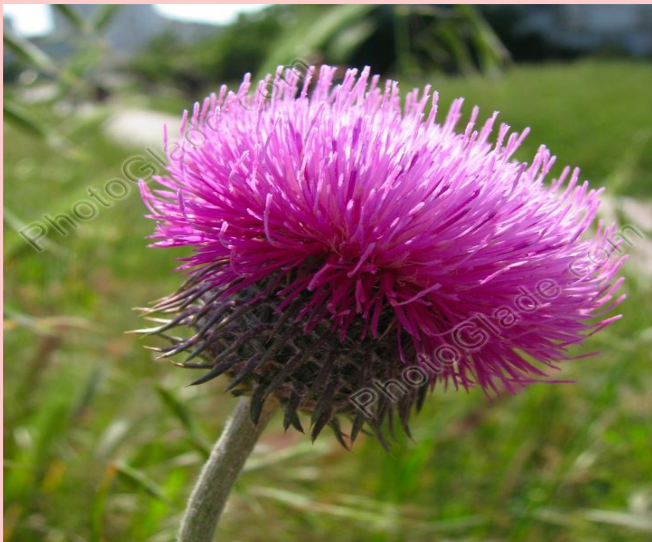
the symbol of Scotland is the thistle