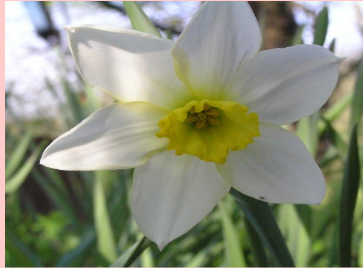
the symbol of Wales is the daffodil