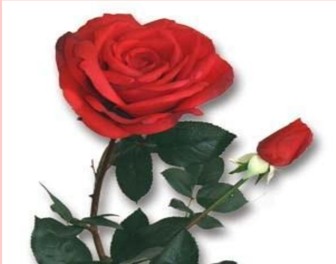
the symbol of England is the red rose