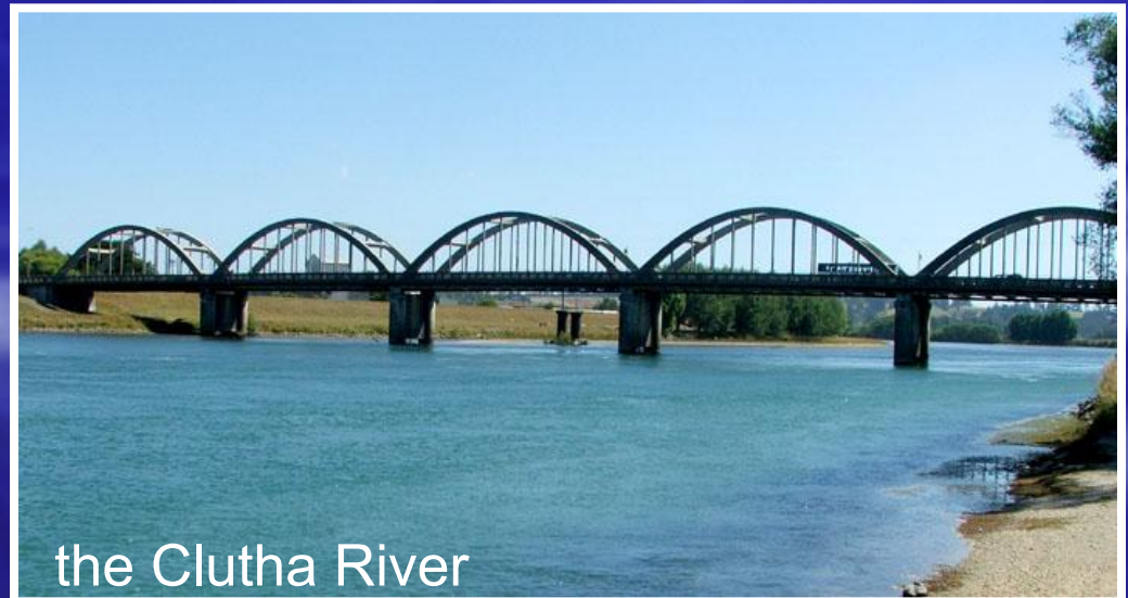
the Clutha River