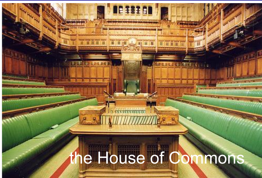
the House of Commons