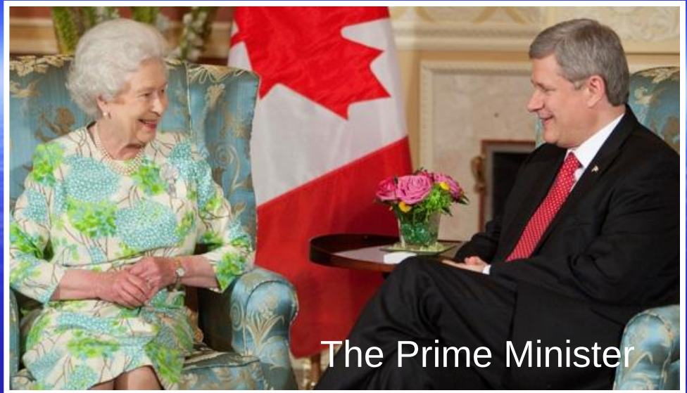
The Prime Minister

The Canadian Parliament? consists of two chambers: the House of Commons and the Senate.