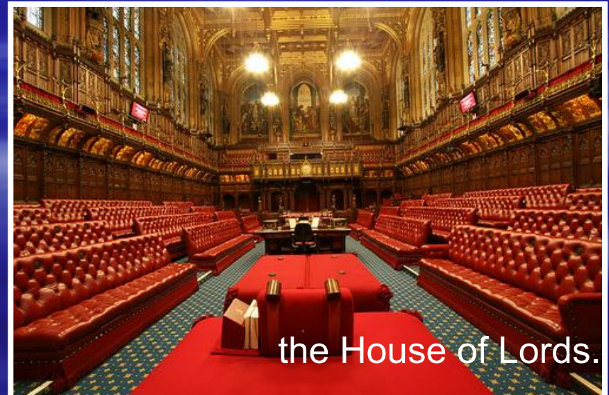
the House of Lords.