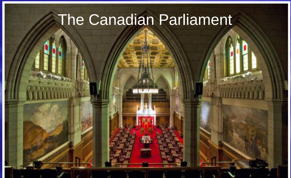
The Canadian Parliament