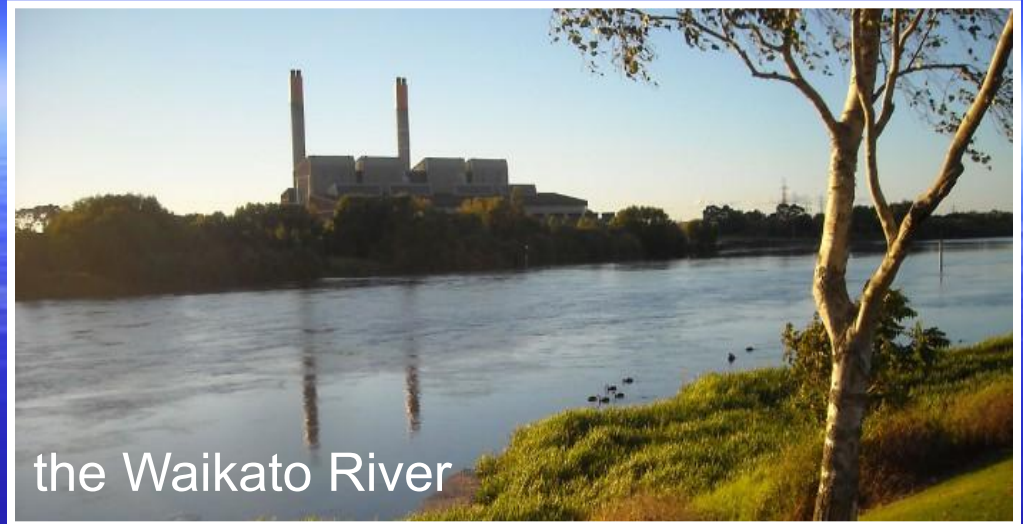
the Waikato River