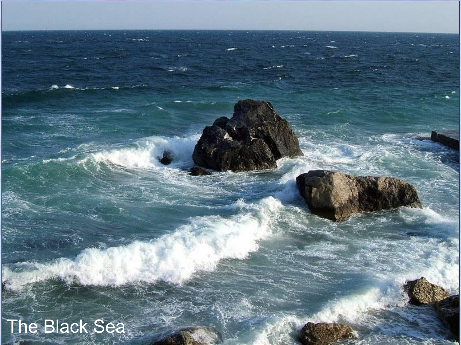
The Black Sea