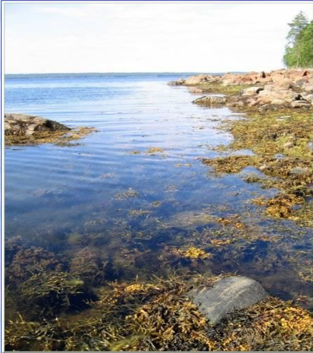
The White Sea