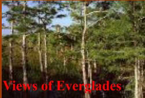
Views of Everglades