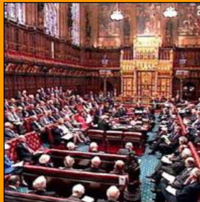
House of Lords