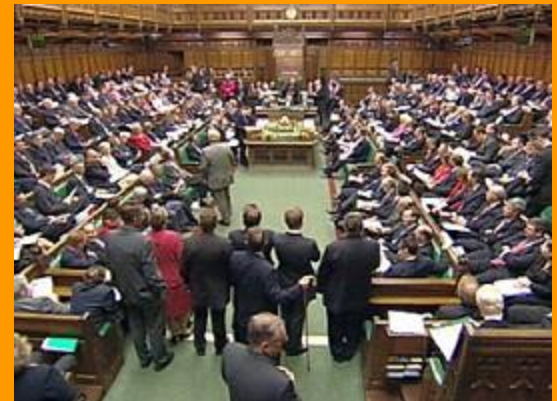
House of Commons