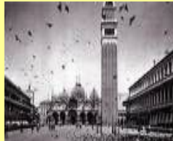
Piazza S.Marco Venezia

The Italian cities have a lot of works of art and other important monuments. In Milan we can see the dome, work of art Gothic that with its gold "madonnina" is become the symbol of the city.