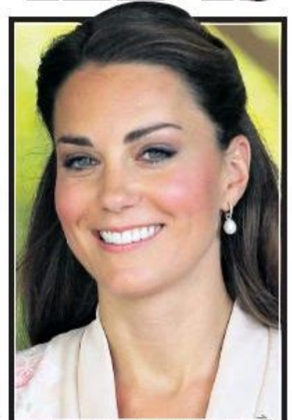
The Queen plans to gift Kate and William a 10-bedroom mansion