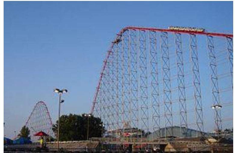
The Magnum XL200 at Cedar Point