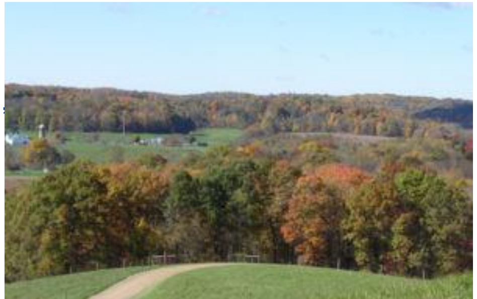
Ohio Fall Colors