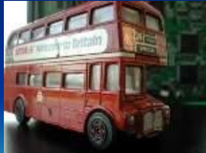
The double-decker bus