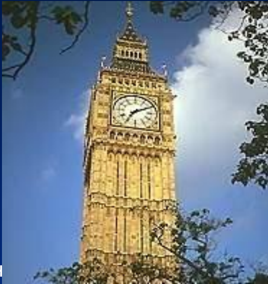
The Queen- Elizabeth II