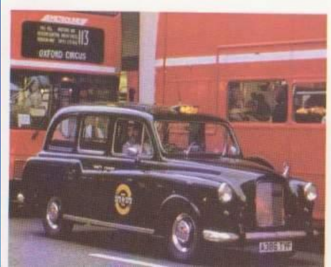
London taxis are called black cubs.