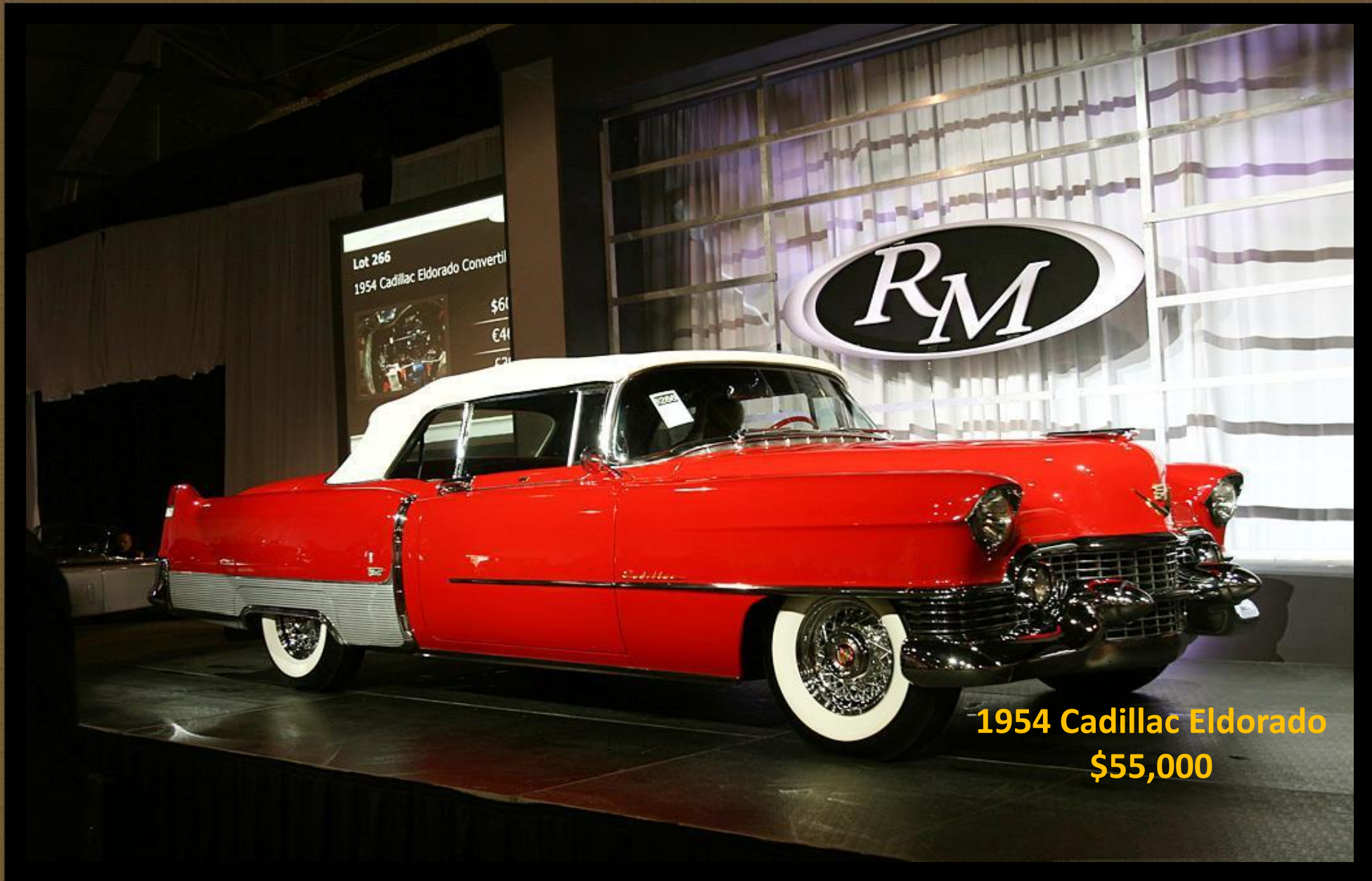
1954 Cadillac Eldorado $55,000