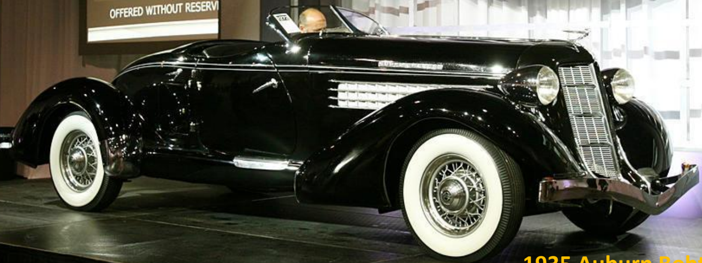
1935 Auburn Bobtail $385,000