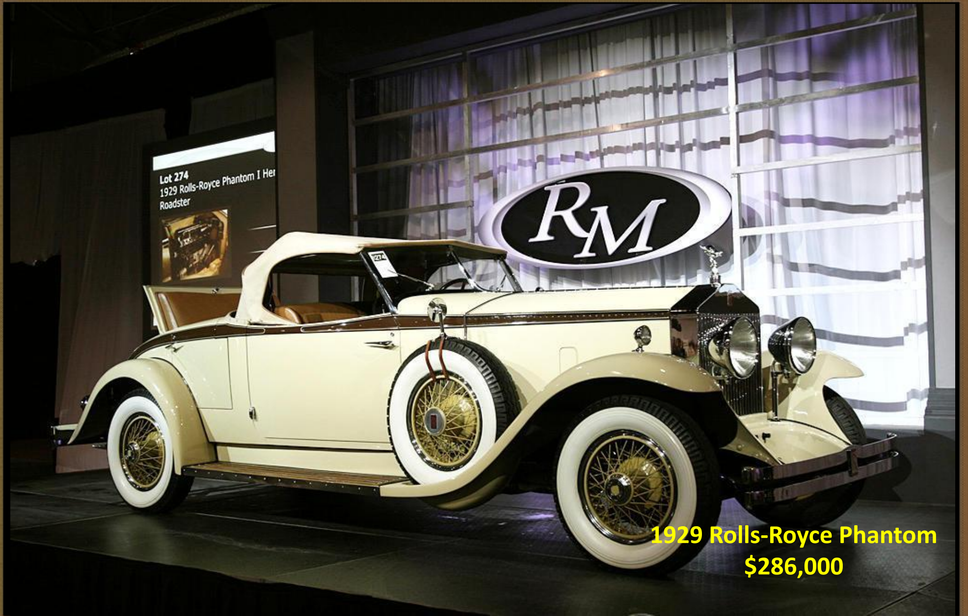
1929 Rolls-Royce Phantom $286,000