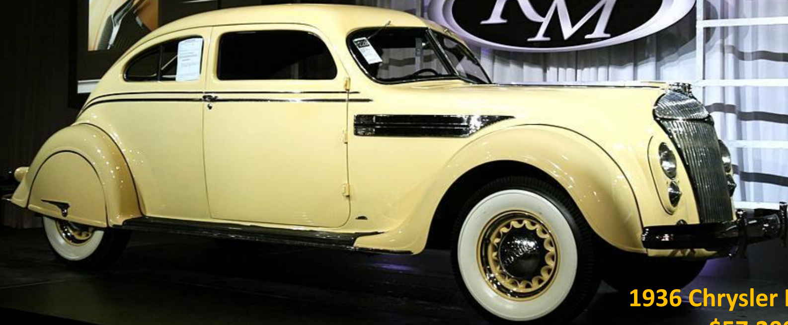
1936 Chrysler Imperial $57,200