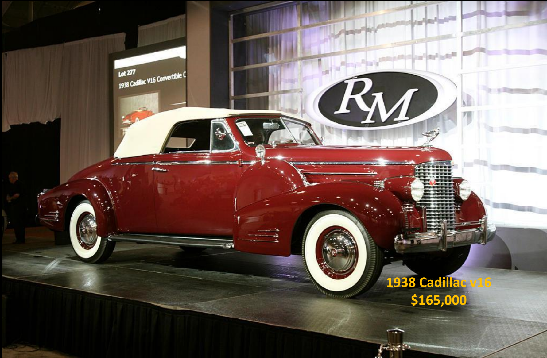
1938 Cadillac v16 $165,000