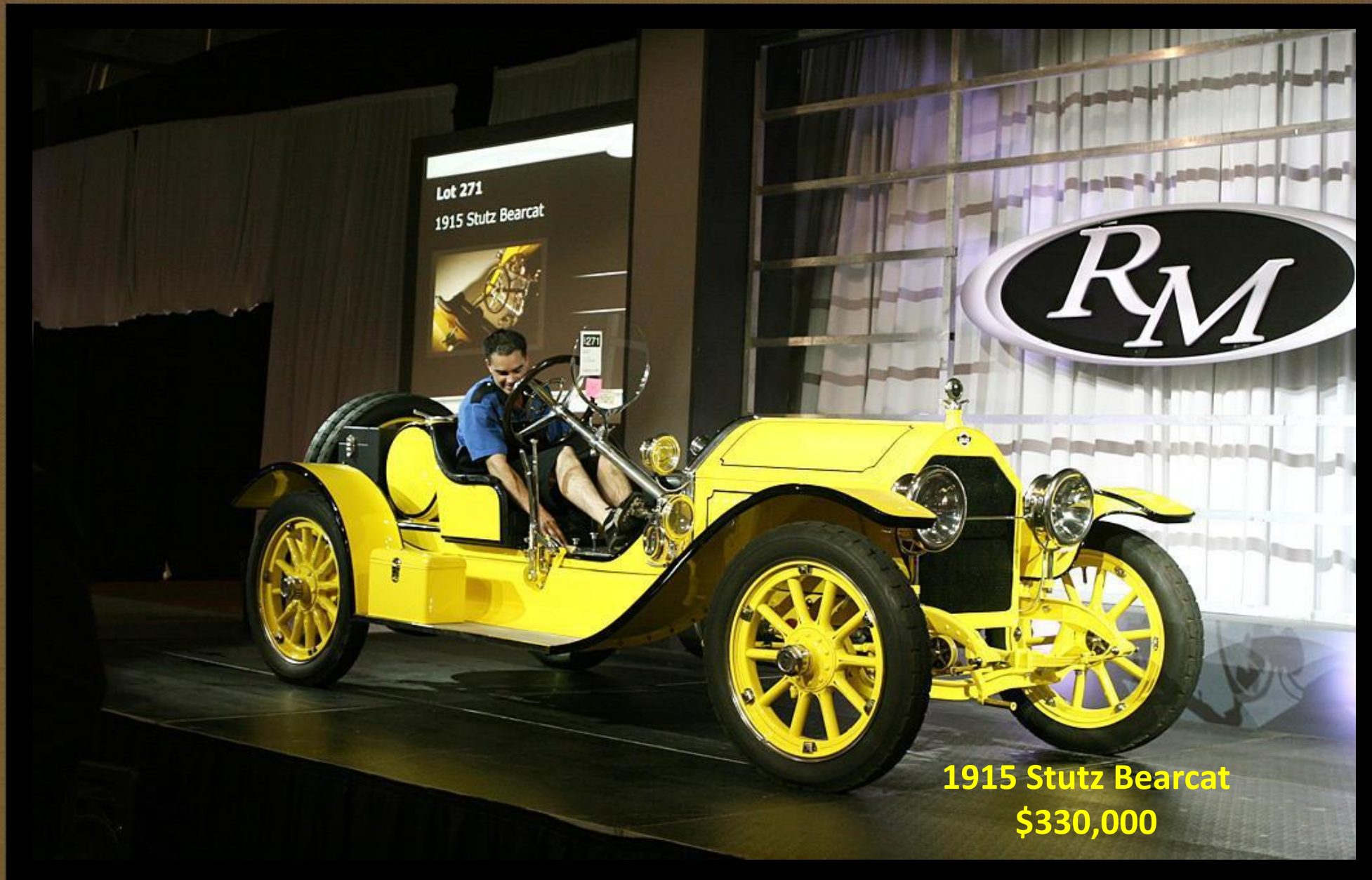
1915 Stutz Bearcat $330,000