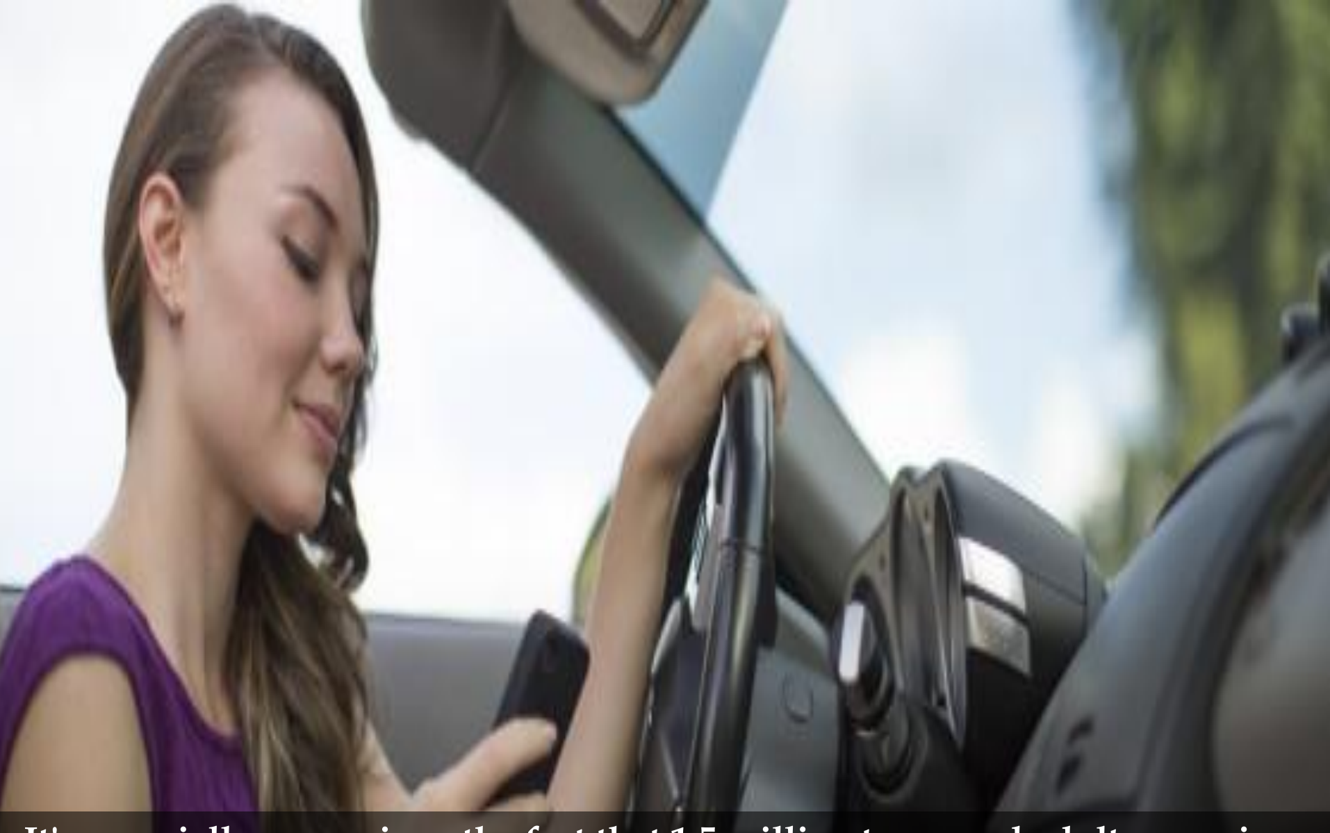
It's especially scary given the fact that 1.5 million teens and adults were in some kind of accident driving while "intexticated" -- texting that last precious "LOL" or "TTYL." It takes just five seconds for one's attention to be diverted from the road. Five seconds!