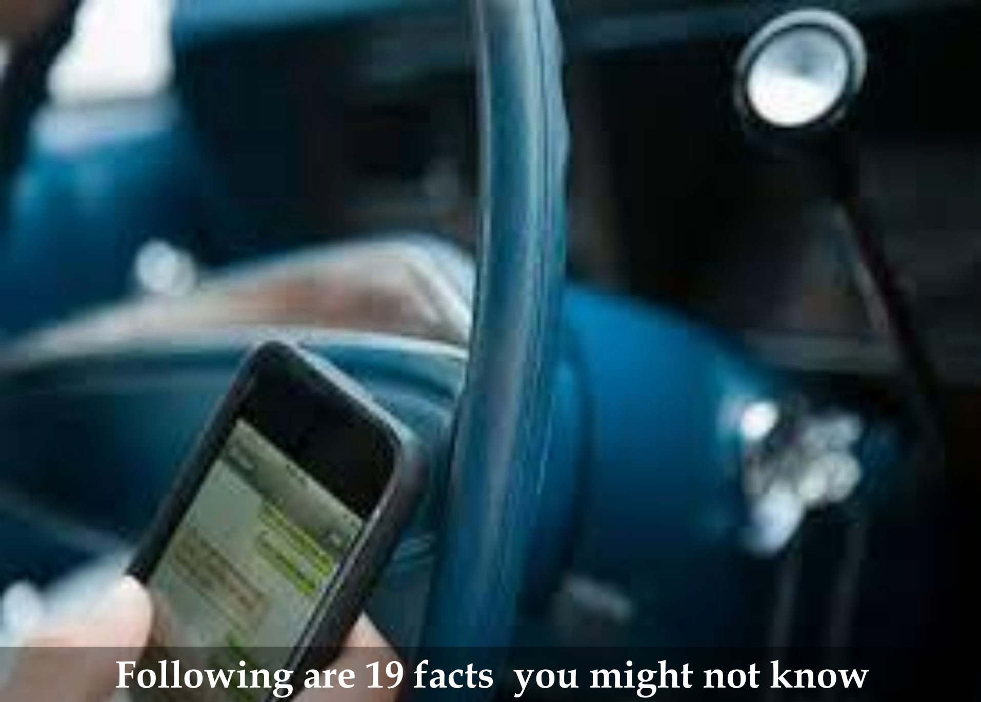
about texting and driving.