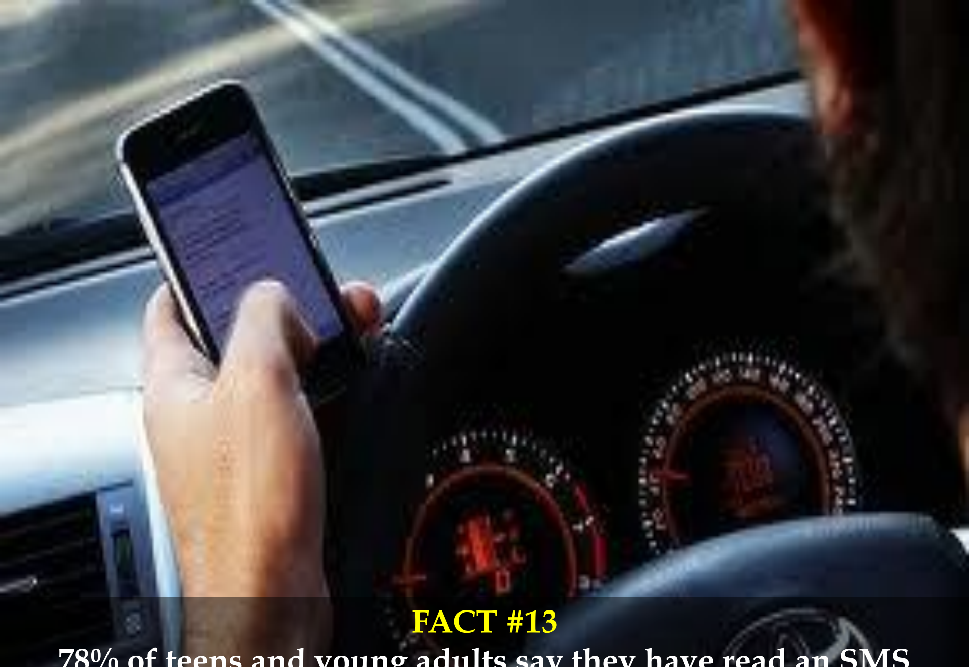
78% of teens and young adults say they have read an SMS message while driving.