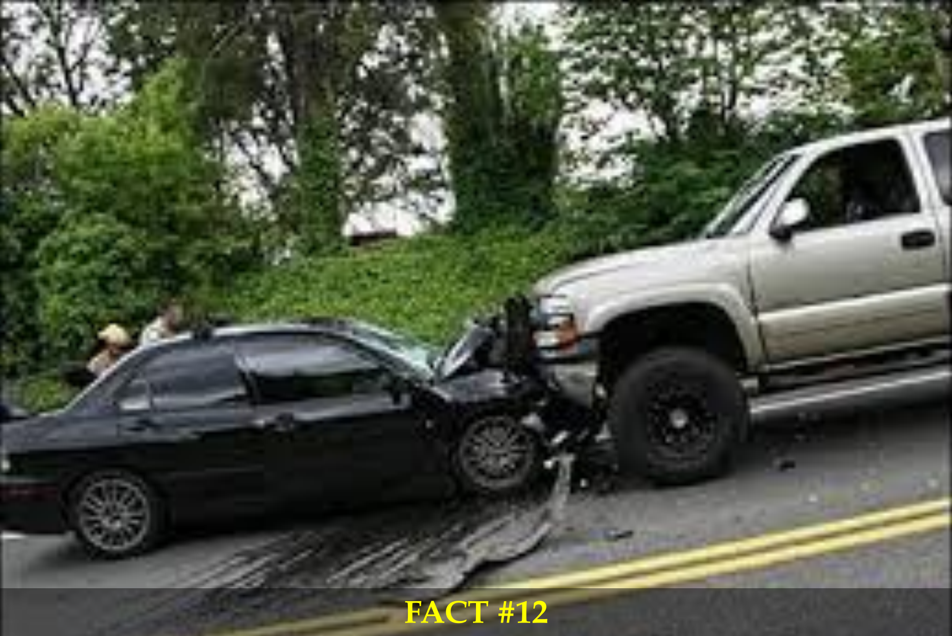
36% of teens say they have been involved in a near-crash because of their own or someone else's distracted driving.