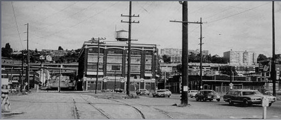
The Ford Assembly Plant, Highland Park, Michigan