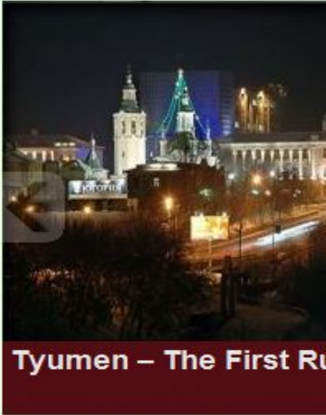
Tyumen – The First Ru