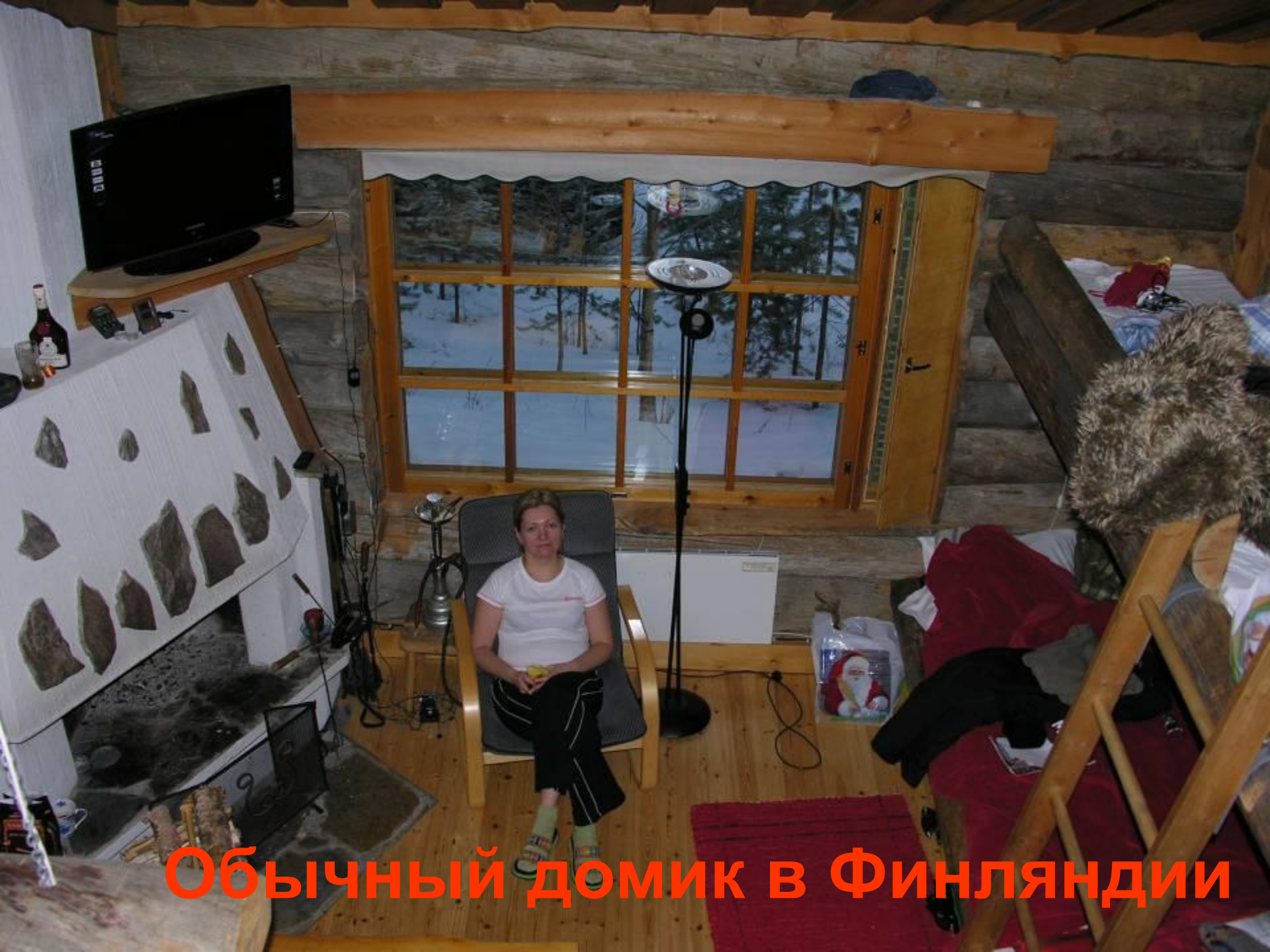
Обычный домик в Финляндии