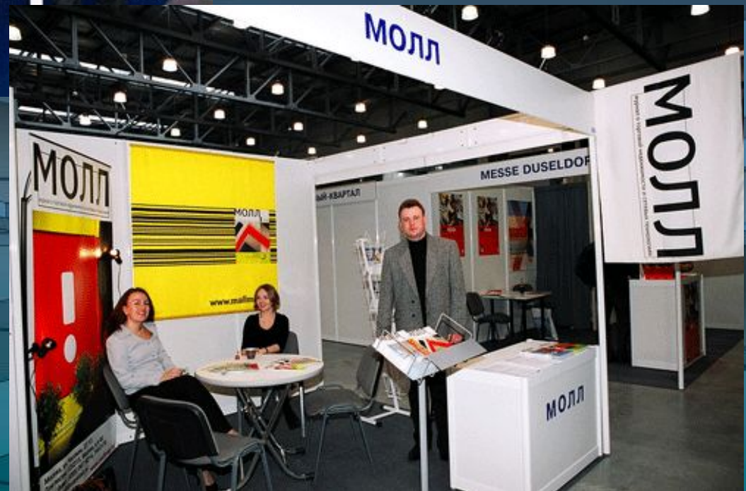
magazine “MALL”, official exhibition edition