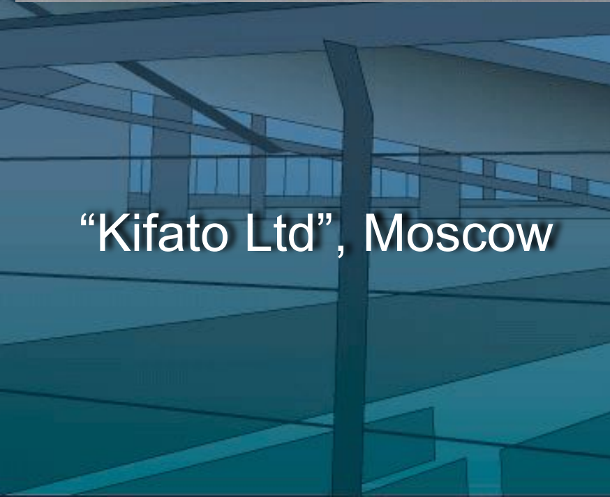
"Kifato Ltd", Moscow