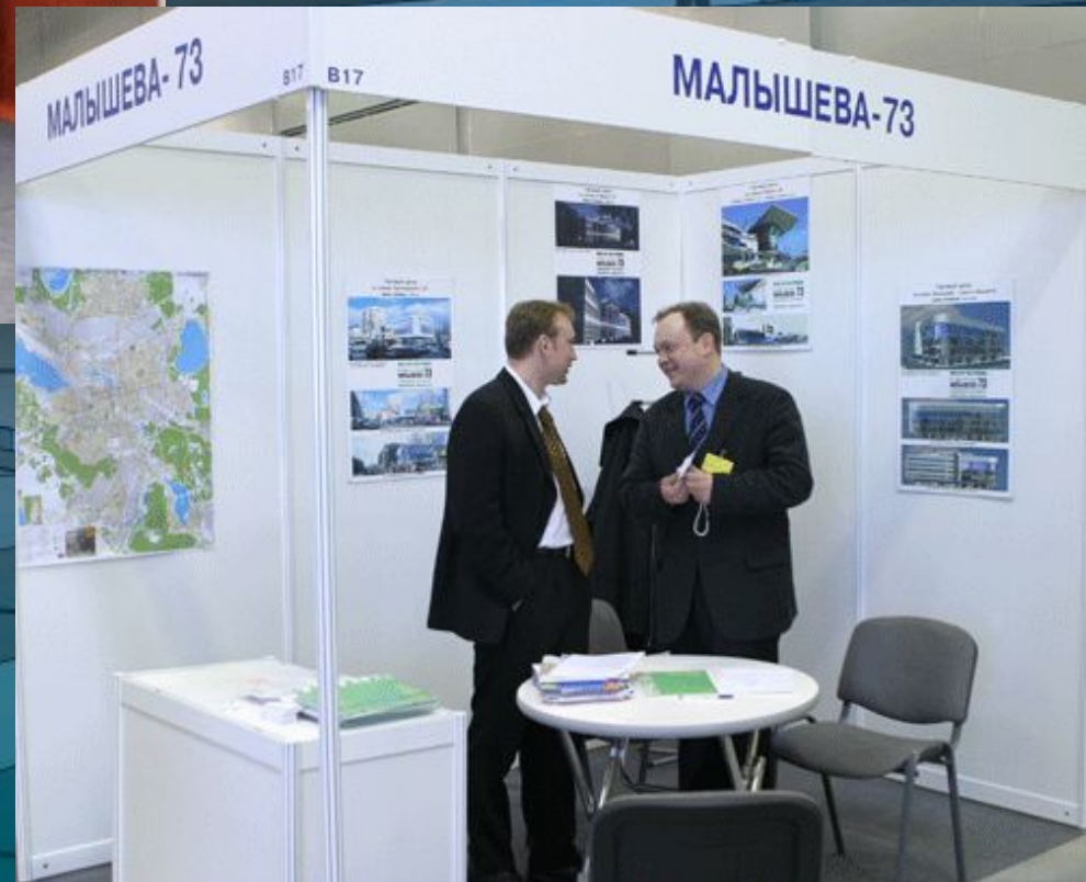
“Malysheva-73 Co.”, Yekaterinburg-city