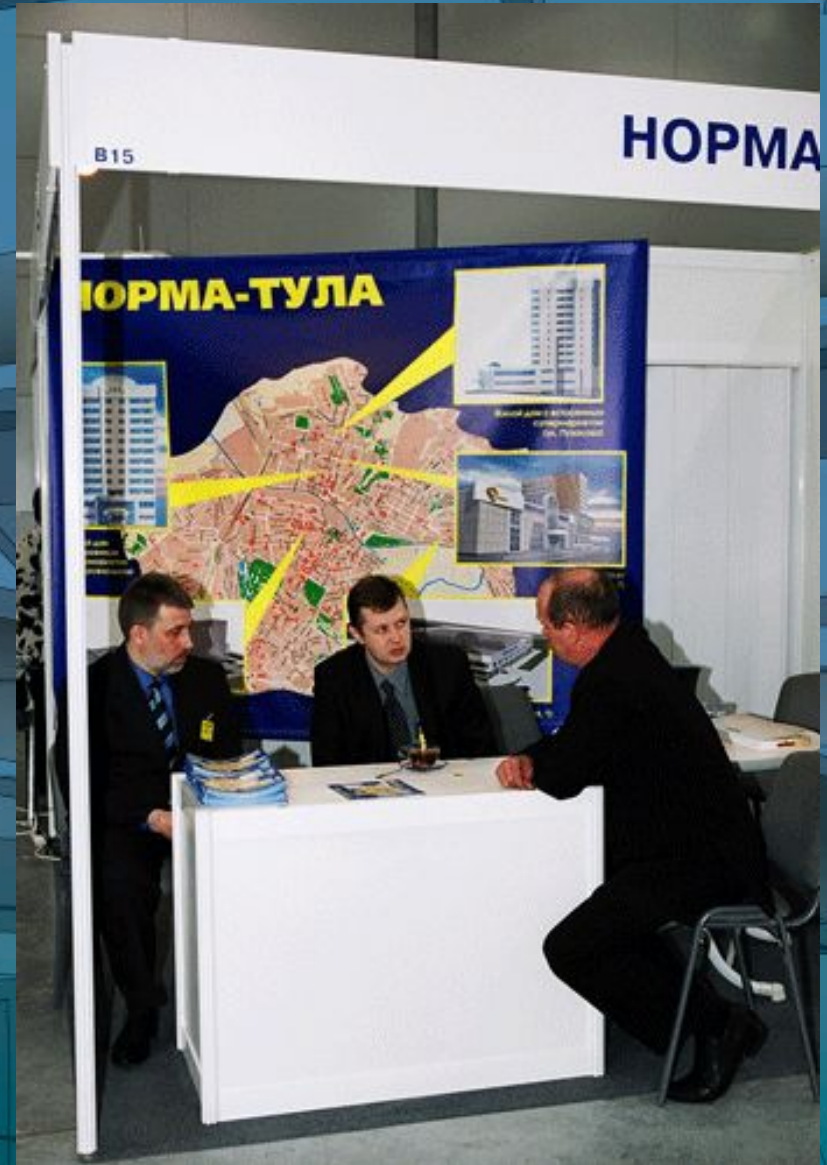
“Norma Ltd.”, Tula-city