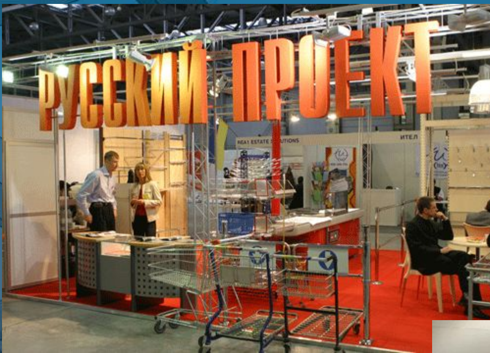
“Russian Project”, Moscow