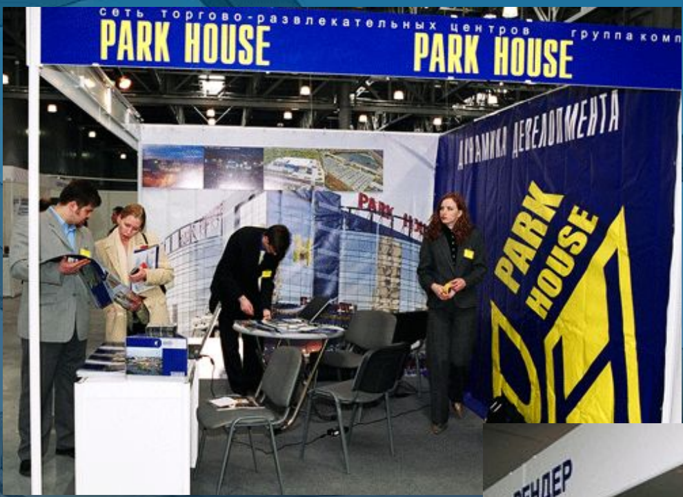
GC "Vremya" Park House, Samara-city