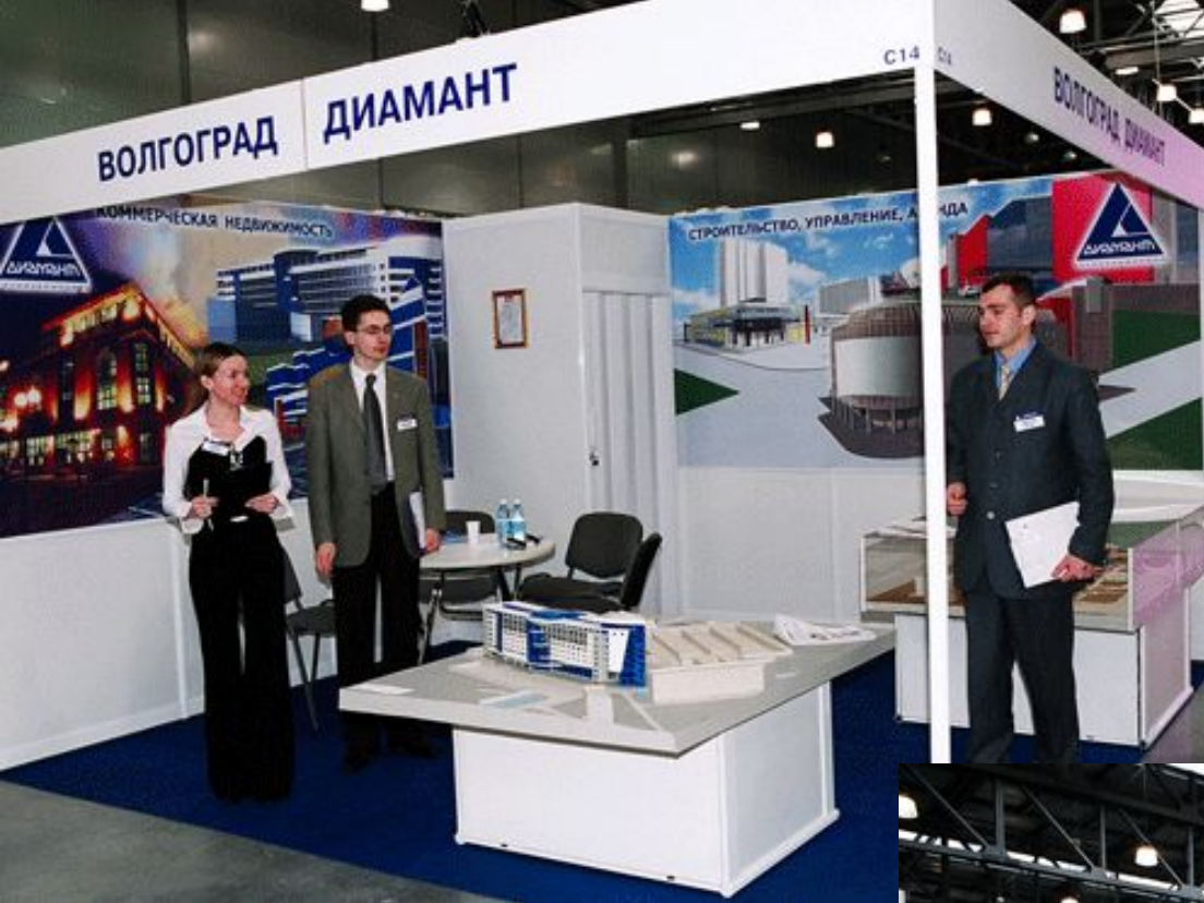
Group of companies “Diamant”, Volgograd-city