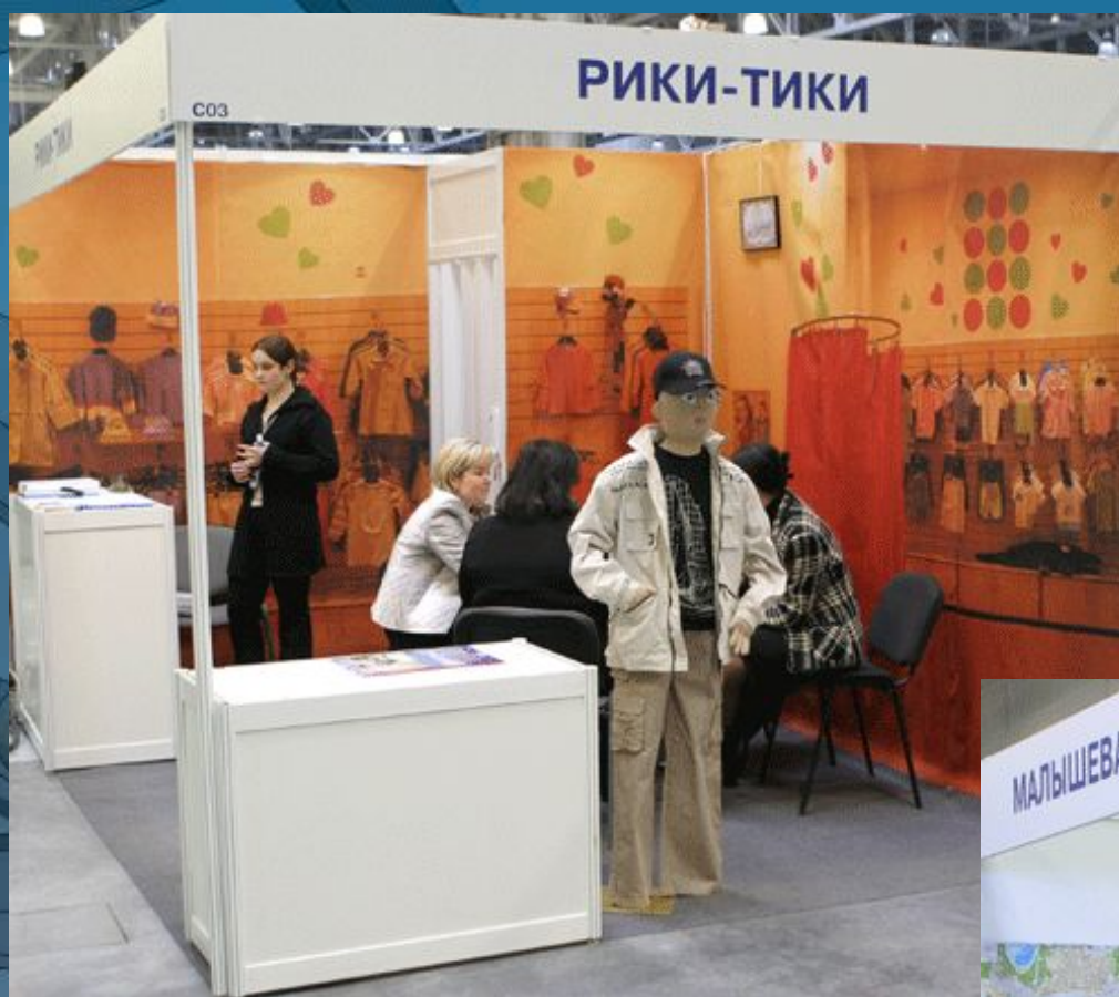
Retail chain “RIKI-TIKI”, Moscow,