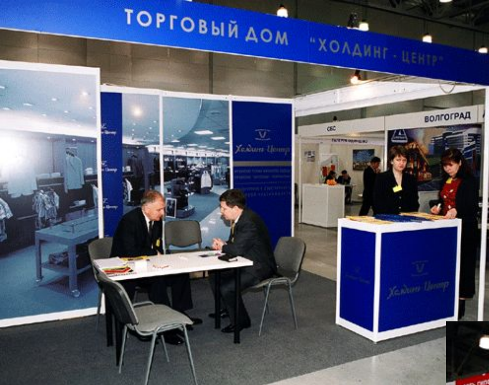
OAO Trading House "Holding-Center", Moscow