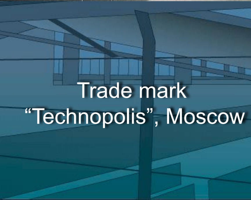
Trade mark "Technopolis", Moscow