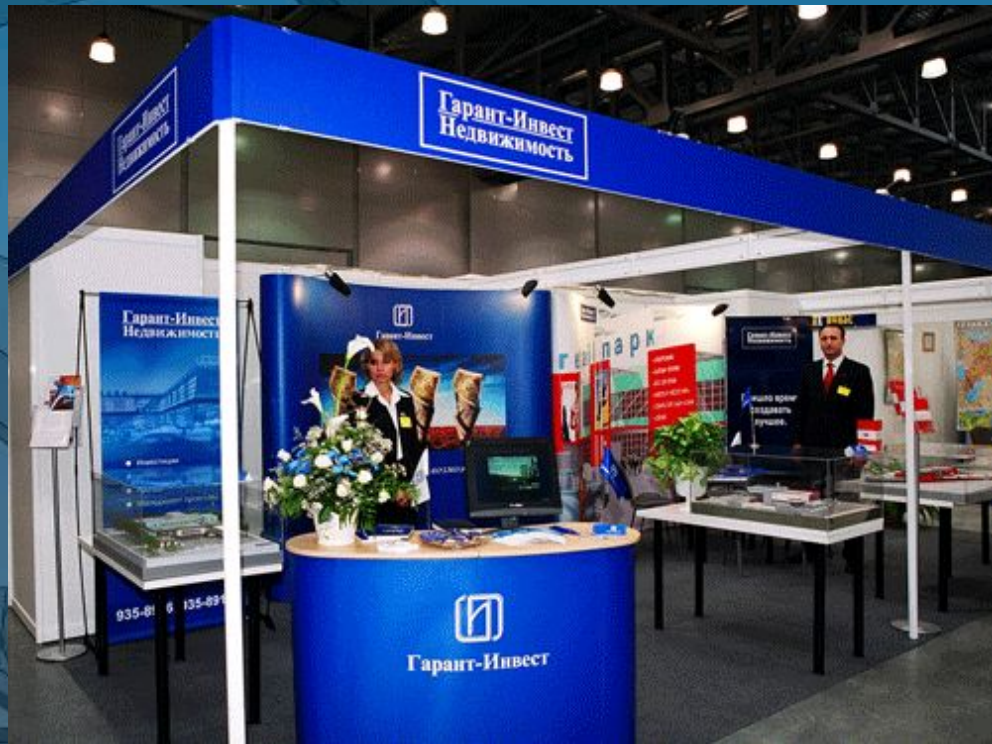
“Garant-Invest-Nedvizhi most’ Ltd.” Co., Moscow