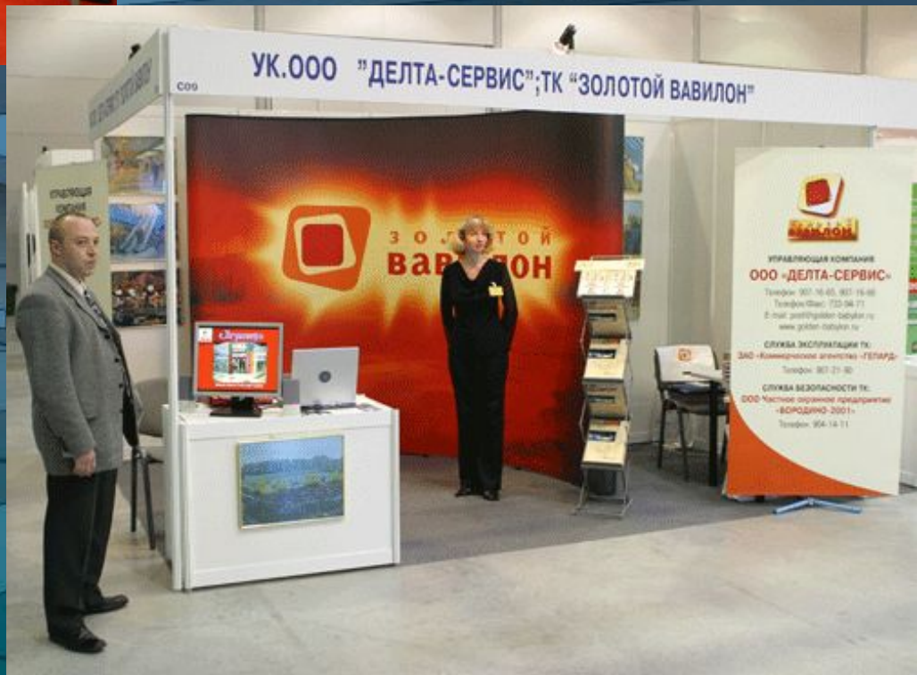
Management company “Delta-Service” shopping center “Golden Babylon”, Moscow