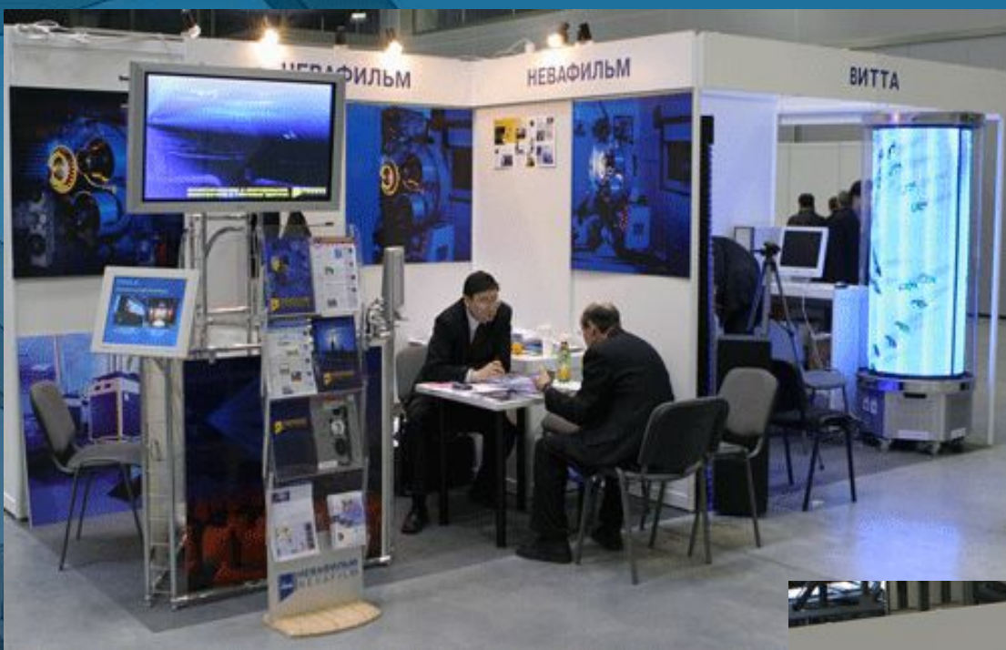
ZAO "NEVAFILM", St. Petersburg-city