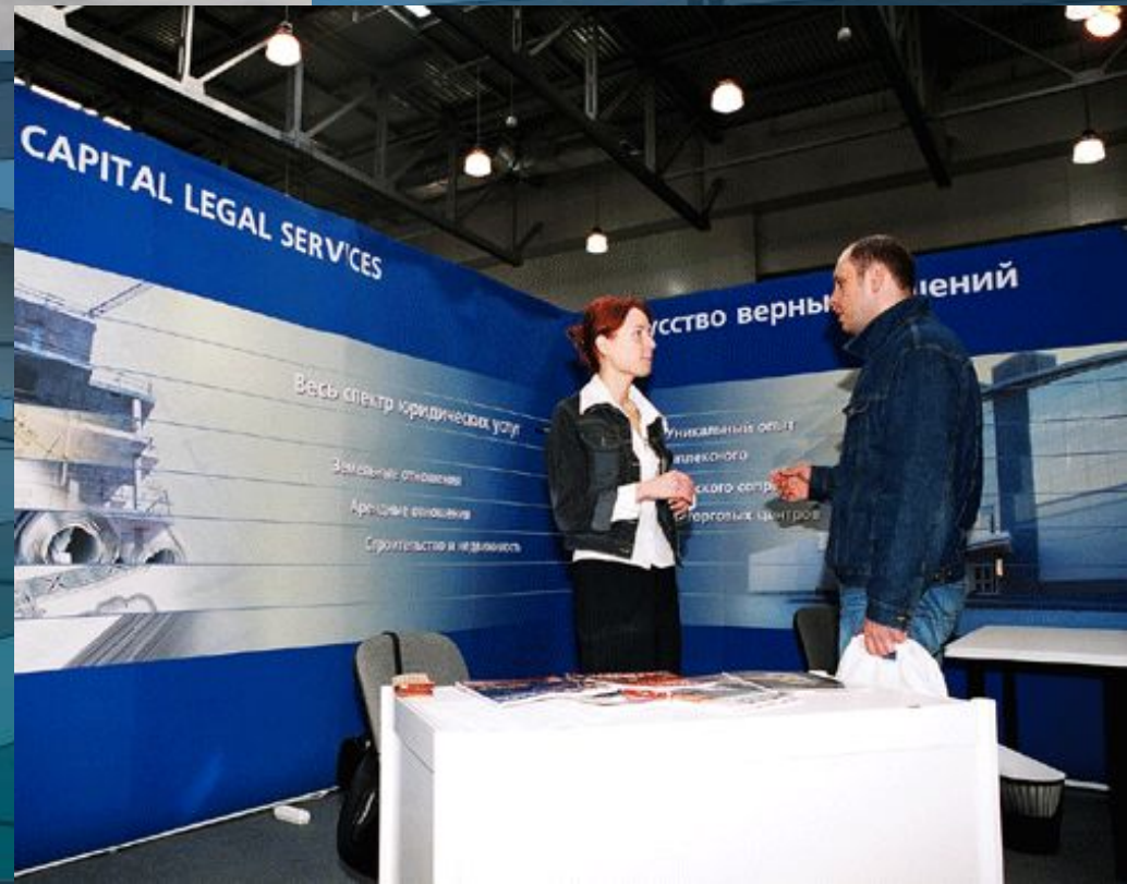
“Capital Legal Services, L.L.C.”, Moscow