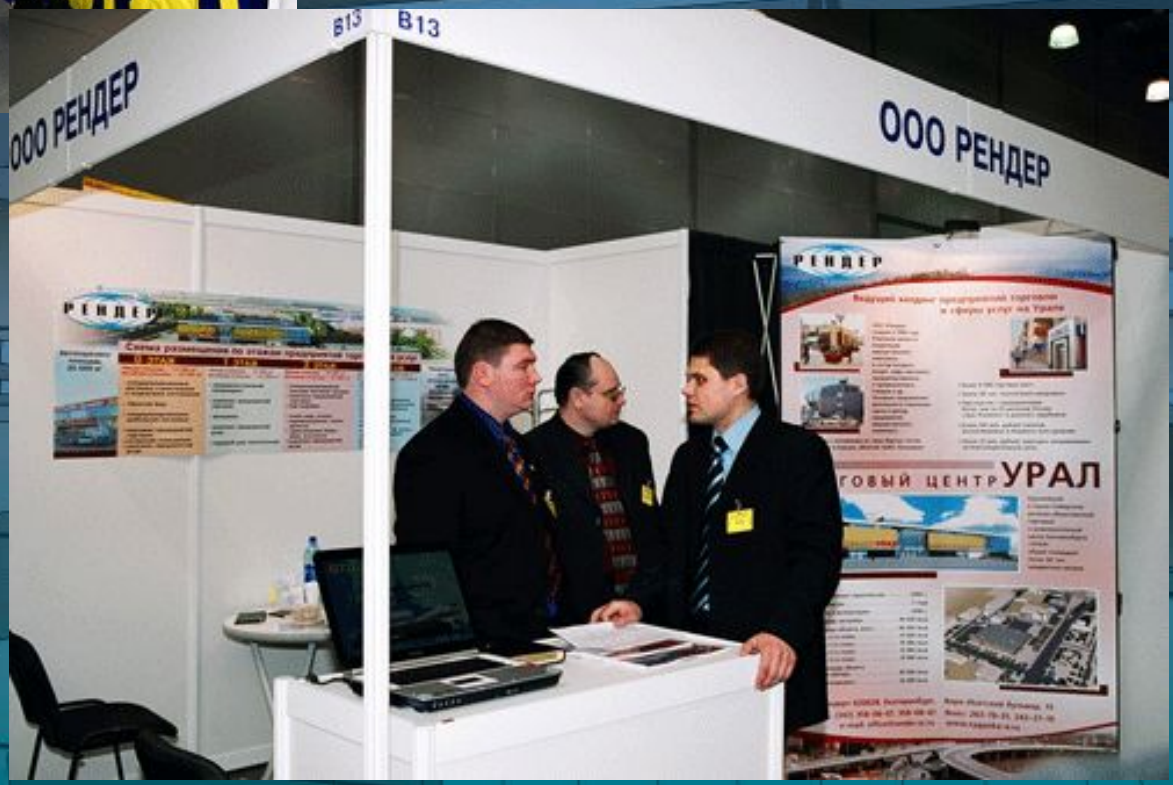
Render Ltd., Yekaterinburg-city