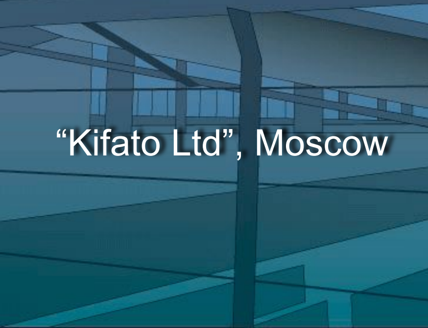
"Kifato Ltd", Moscow