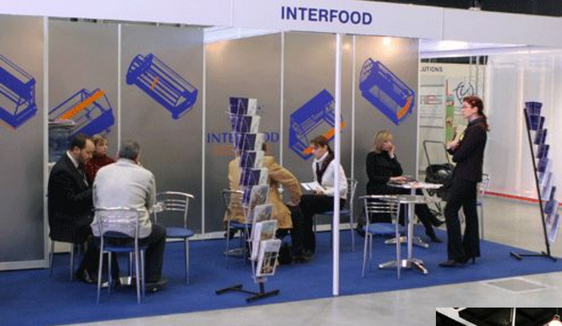
“INTERFOOD Ltd.”, Moscow