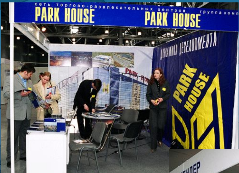
GC "Vremya" Park House, Samara-city