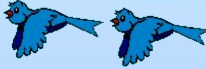
The birds/ fly