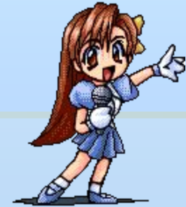
The girl/ sing