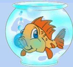
The fish/ swim