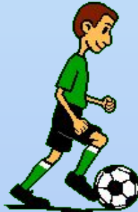
The boy/ play football