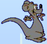
The kangaroo/ jump