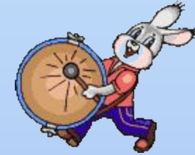
The hare/ play the drum