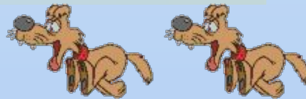
The dogs/ run