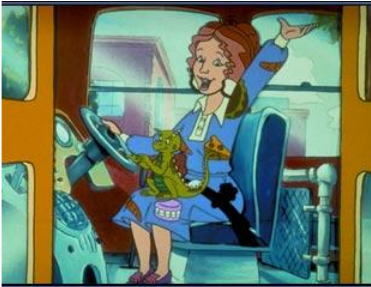
Вэлэри Фризл – Magic School Bus.