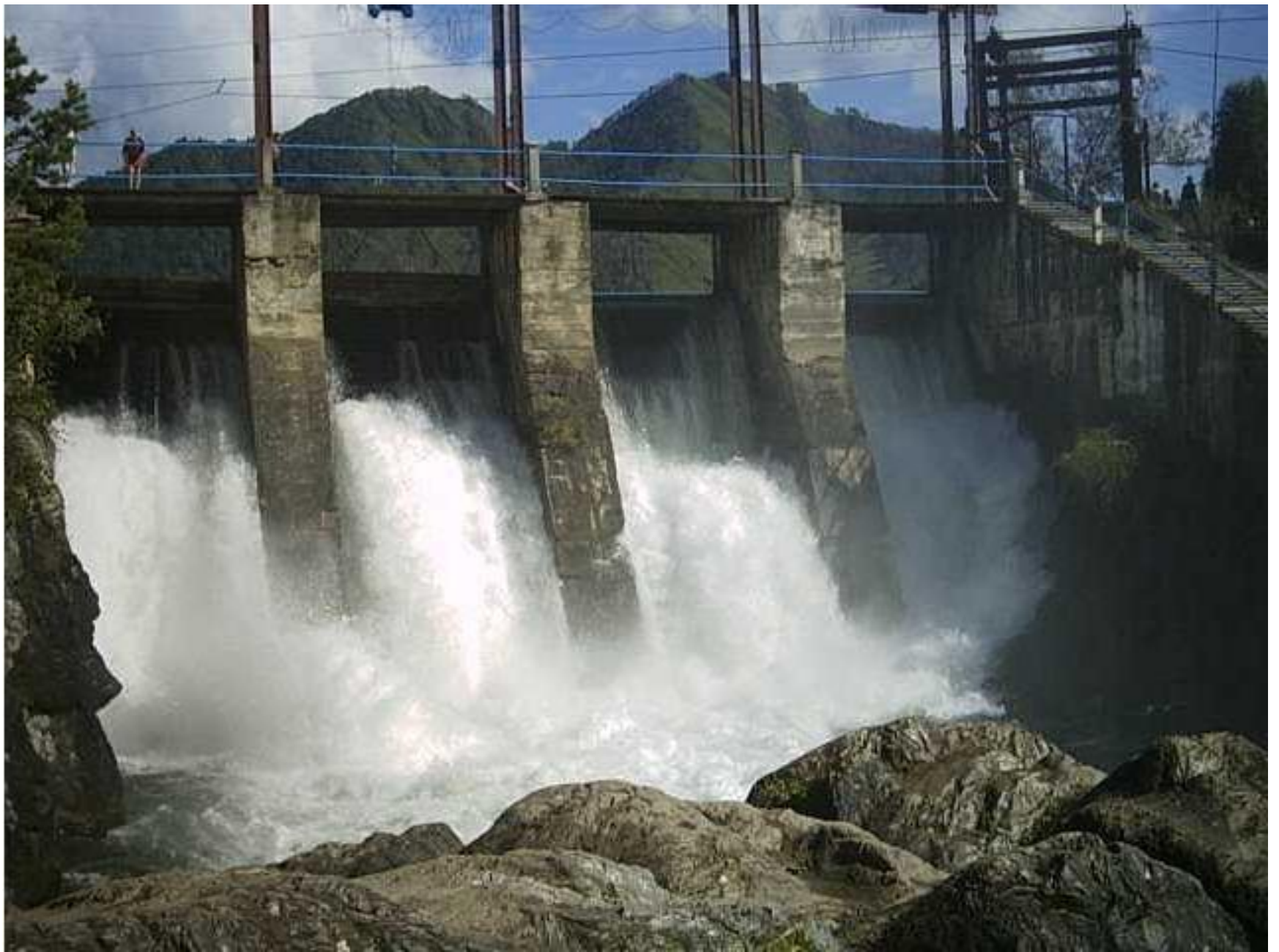
Гидро Электро Станция