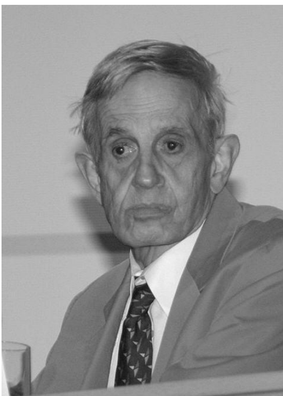
Нэш, Джон Форбс: (born June 13, 1928) is an American mathematician and economist whose works in game theory, differential geometry, and partial differential equations have provided insight into the forces that govern chance and events inside complex systems in daily life. His theories are still used today in market economics, computing, accounting and military theory.