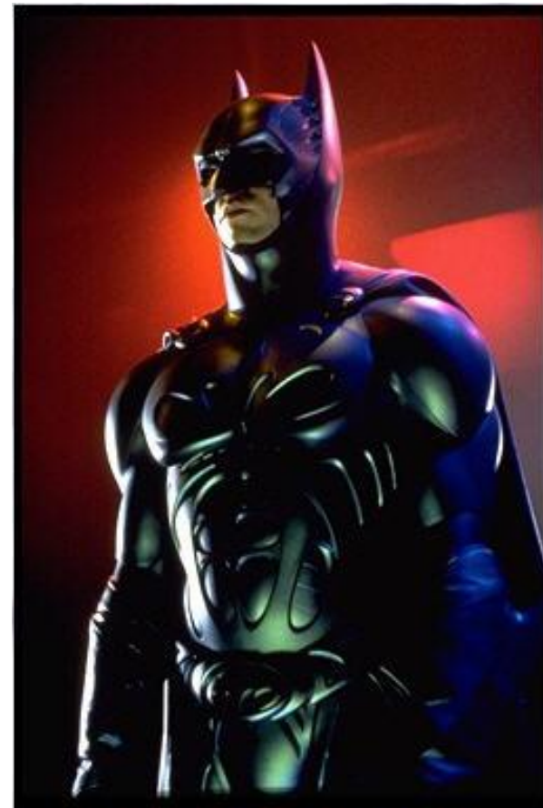
Batman Forever (1995)