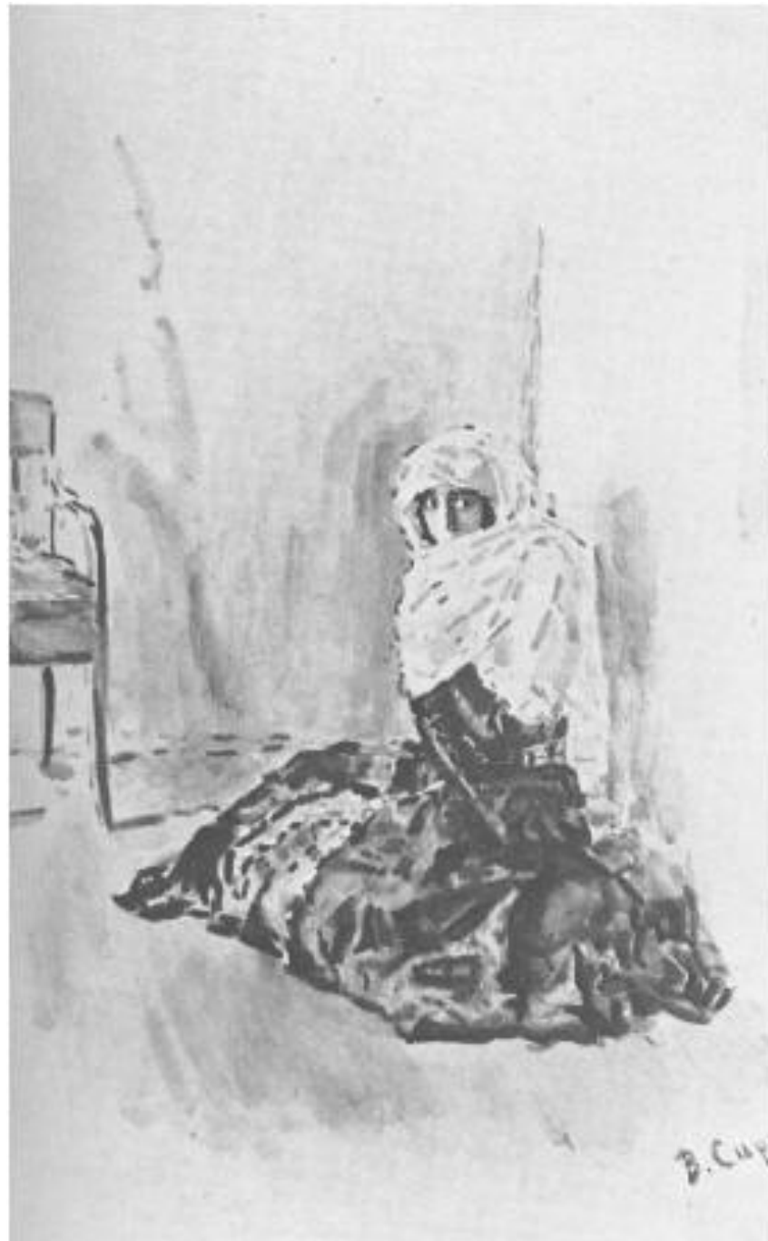
«Бэла». Иллюстрация В.А. Серова. 1891 г.