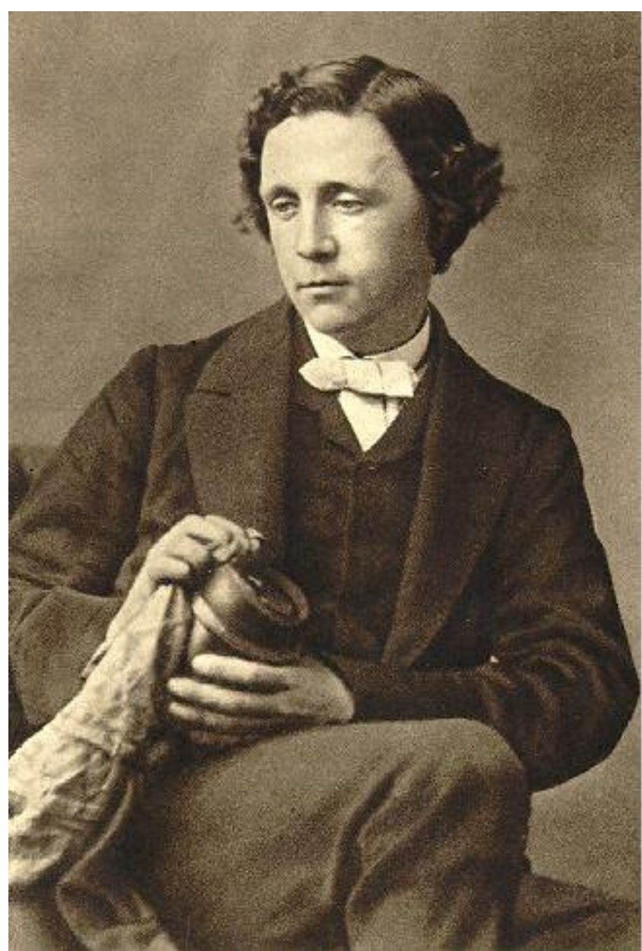
Lewis Carroll (Charles Lutwidge Dodgson)