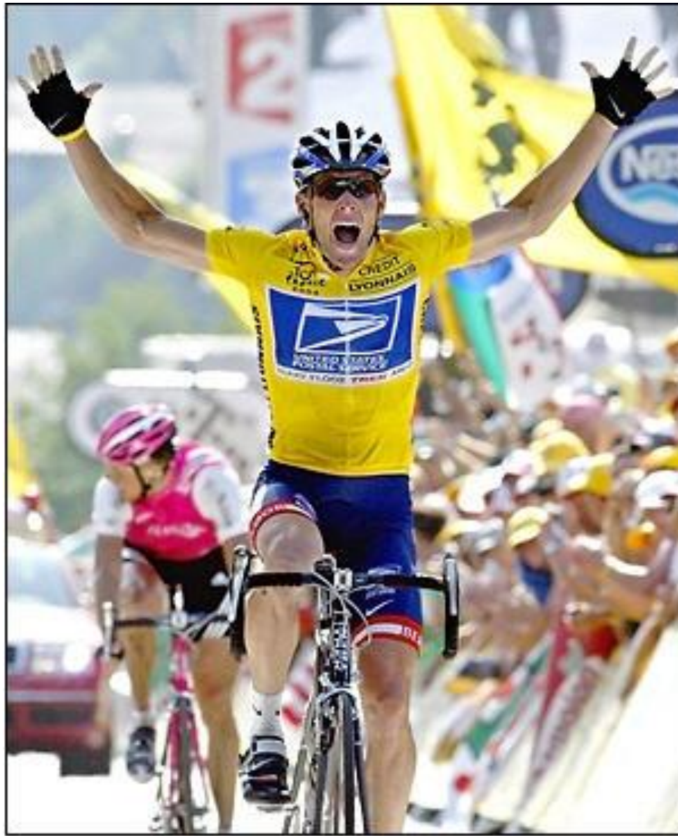
Lance Armstrong: an American professional road racing cyclist who rides for UCI ProTeam Team Astana. He won the Tour de France a record-breaking seven consecutive years, from 1999 to 2005. He is the only individual to win seven times.