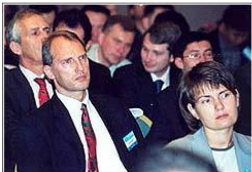
IX Almaty interbanking Conference