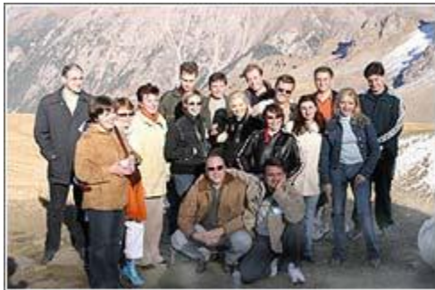
Trip to Shimbulak