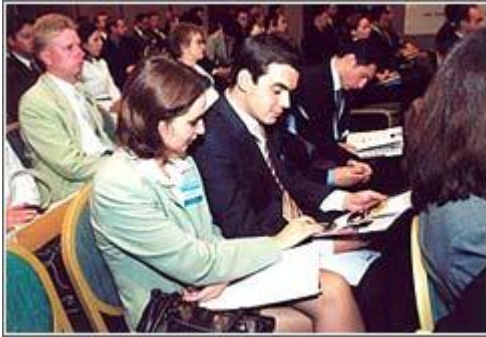
III Almaty Interbanking Conference