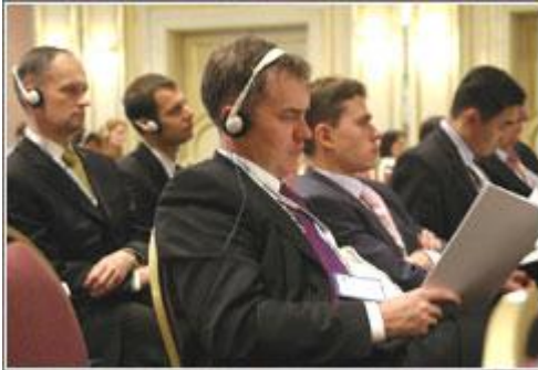
VI Almaty Interbanking Conference