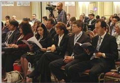
V Almaty Interbanking Conference

Organizing committee is pleased to invite your respectable company to take part as a Sponsor of the conference.