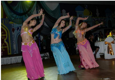
«Eastern Fairy Tale» - Gala-dinner 2006