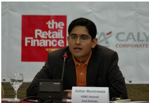
VII Almaty Interbanking Conference