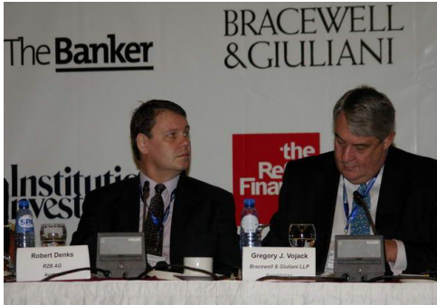
Sponsors of VI conference