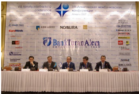
VIII Almaty Interbanking Conference