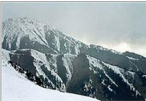
Zailiyskiy Alatau mountains