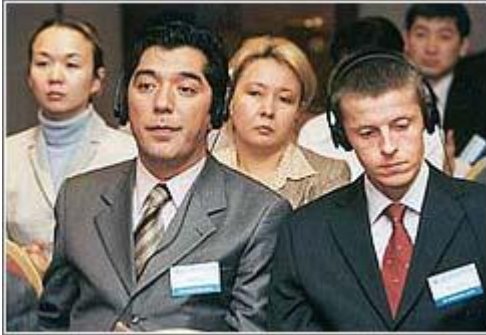
IX Almaty Interbanking Conference