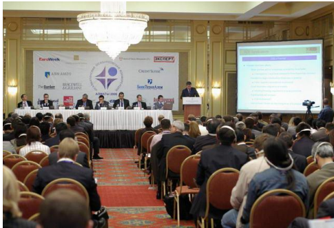
VII Almaty Interbanking Conference