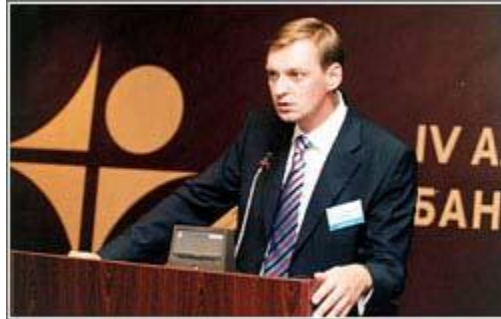
IV Almaty Interbanking Conference

IX Almaty Interbanking Conference – more than 500 participants from more than 50 countries: