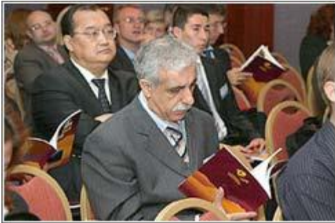
V Almaty Interbanking Conference

Main topic of IX Almaty Interbanking Conference: «World credit crunch: CIS banking systems – new rules of the game».