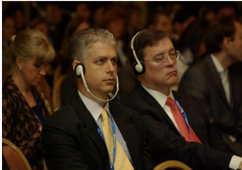
VIII Almaty Interbanking Conference