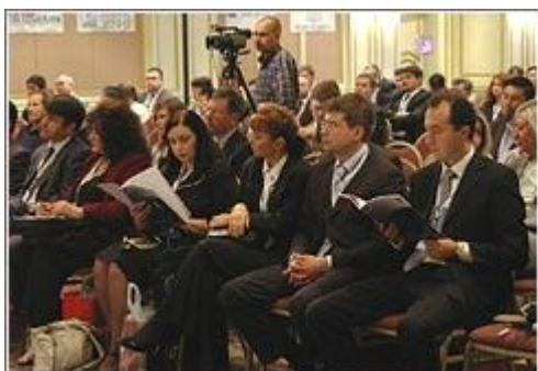
X Almaty interbanking Conference