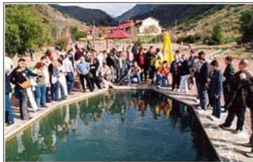
Mountain picnic at trout lakes