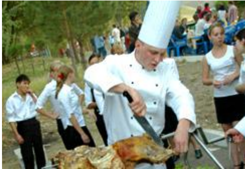
Trip to the mountains