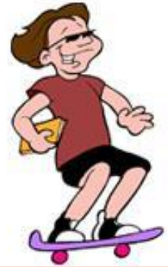
ride a skateboard