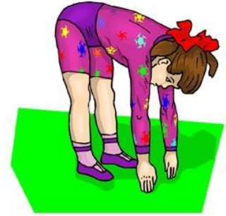
touch your toes