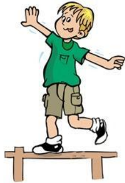
balance on one foot