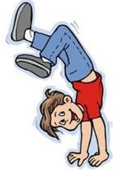
do a handstand