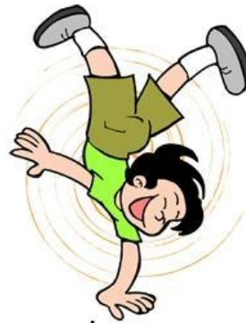
do a cartwheel