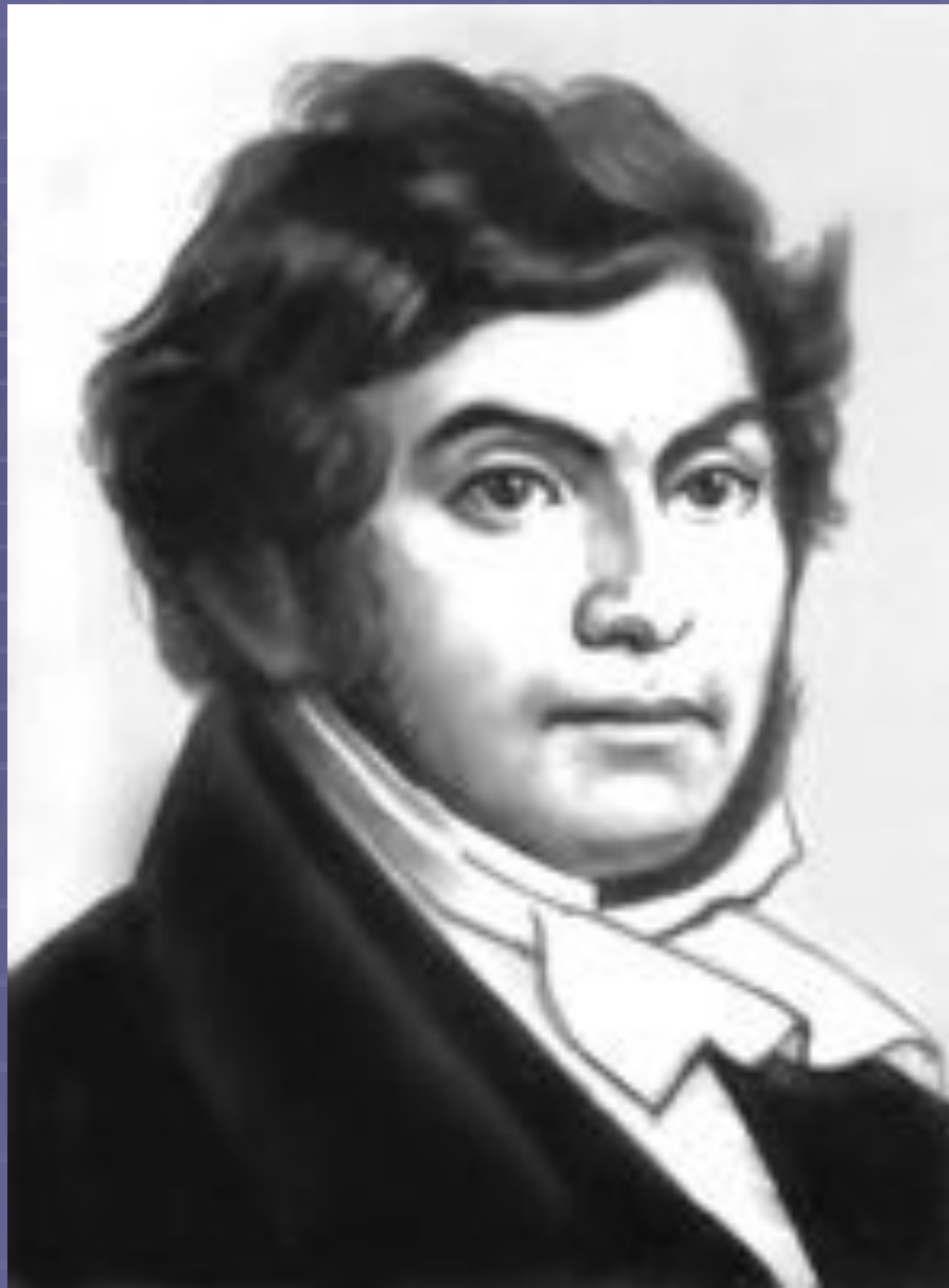
Французский ученый Жан Франсуа Шампольон (1790 – 1832)