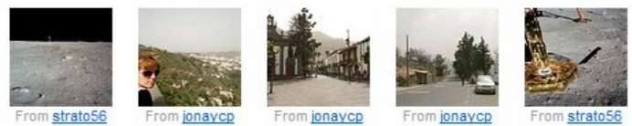
From strato56 From jonavcp From jonavcp From jonavcp From strato56