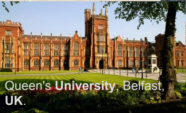
Queen's University, Belfast, UK.