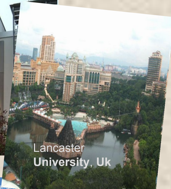
Lancaster University, UK