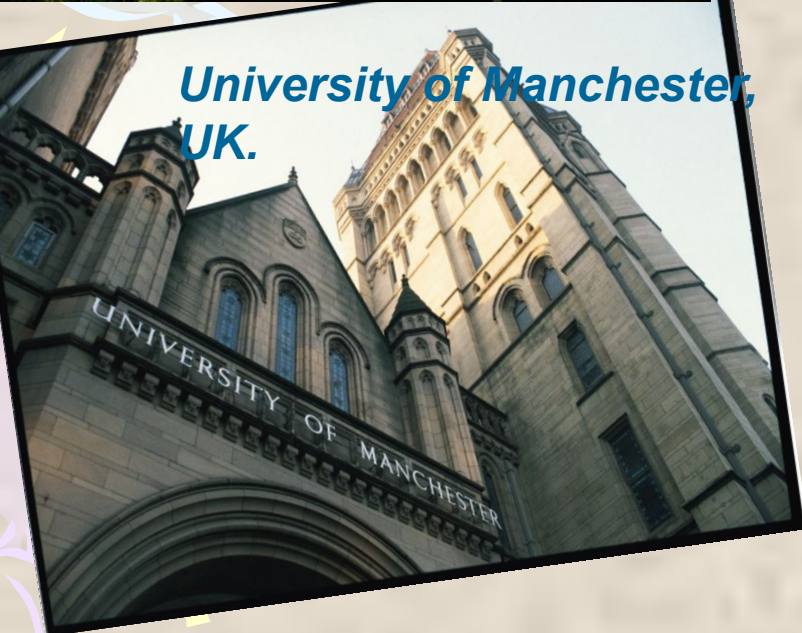
University of Manchester, UK.