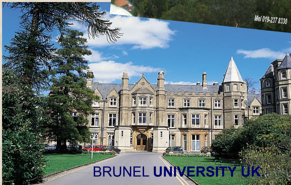
BRUNEL UNIVERSITY UK