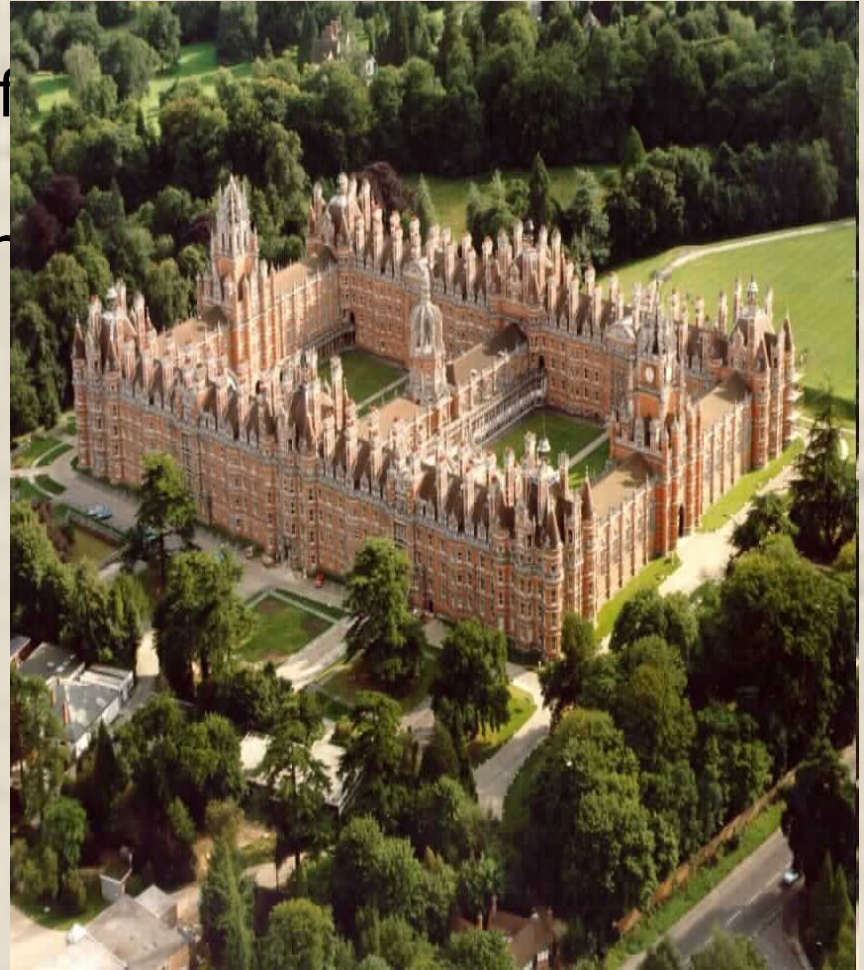
University of London.

Following two years of study, students may take A-Level (short for Advanced Level) examinations, which are required for university entrance in the UK.