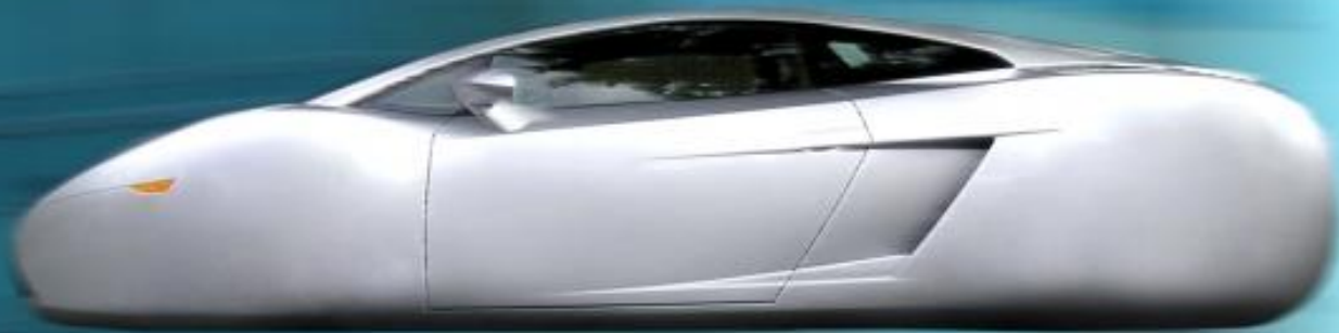
Model Eagle F005

It`s very fast, reliable and have a compact size.