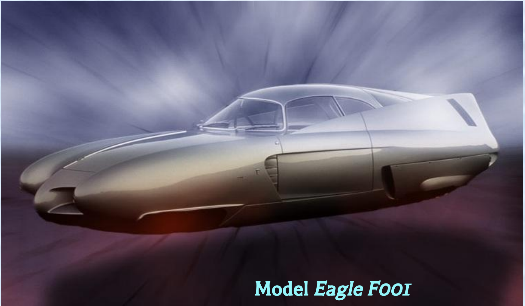
Model Eagle Foo1