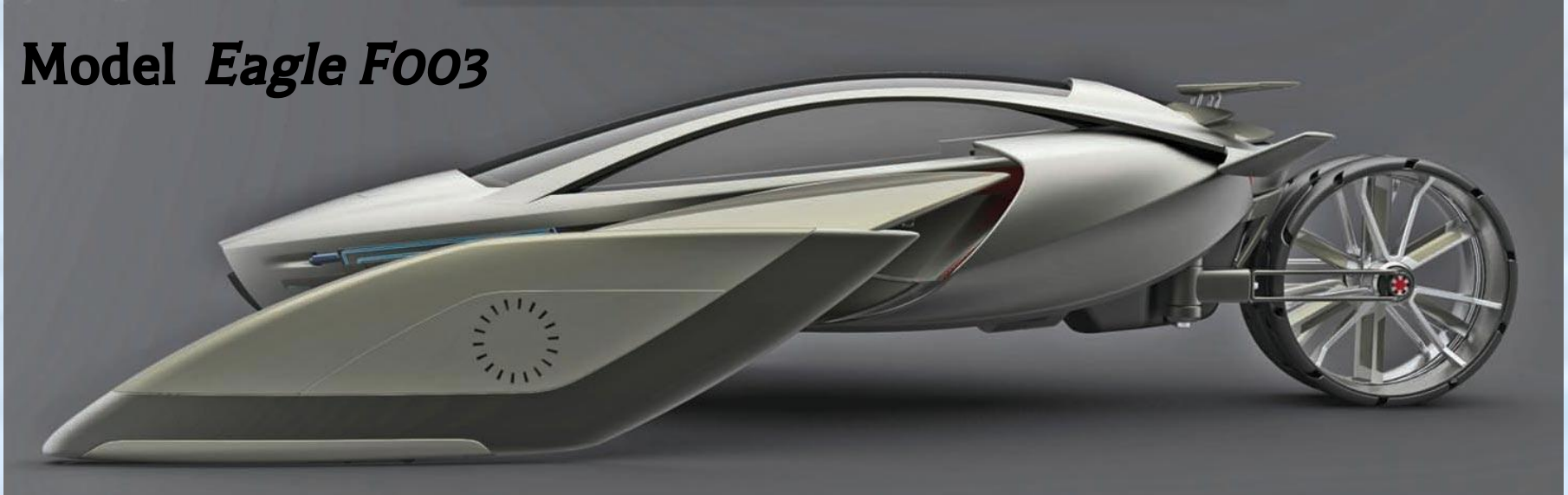
Model Eagle F003