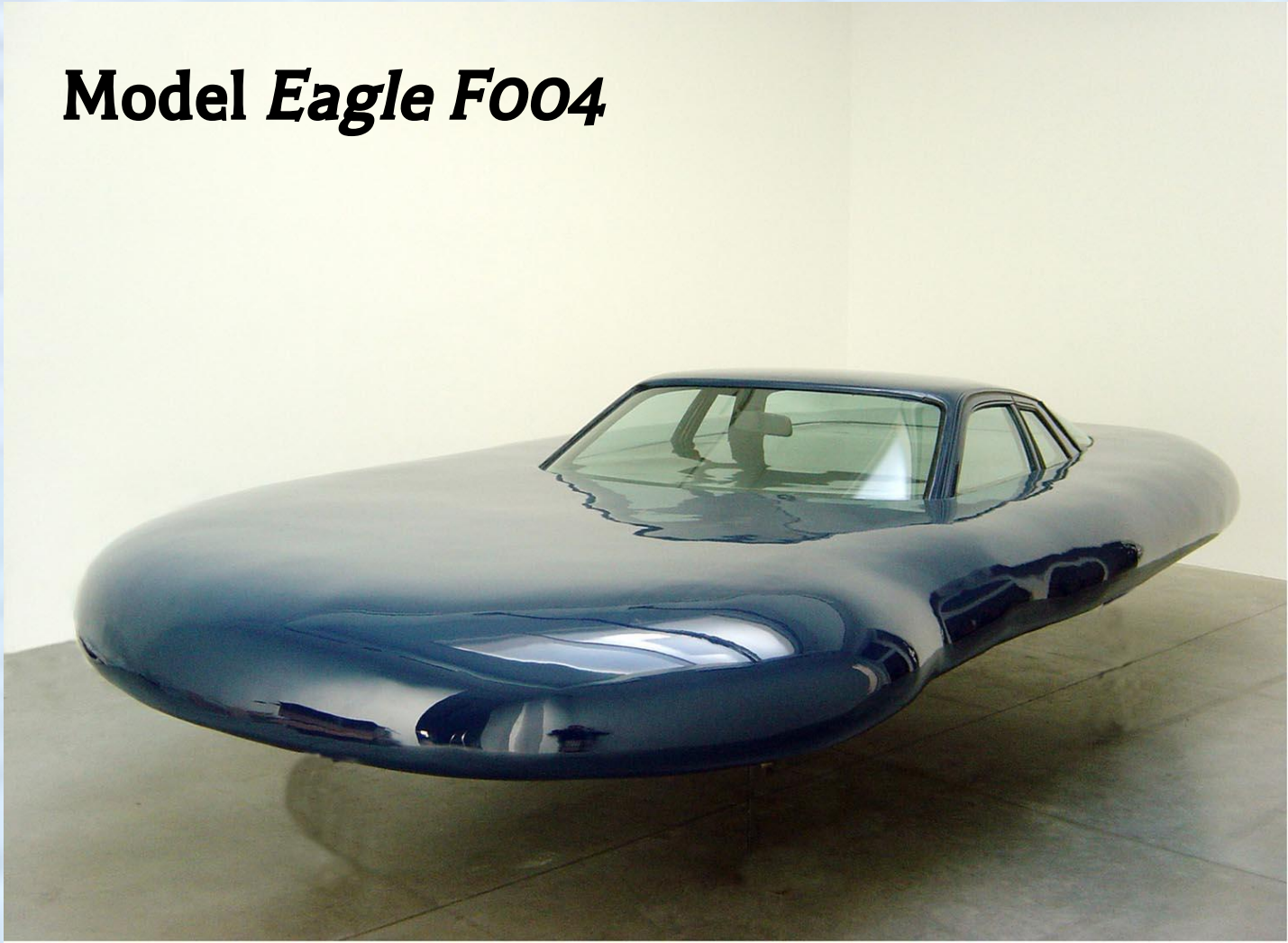
Model Eagle F004