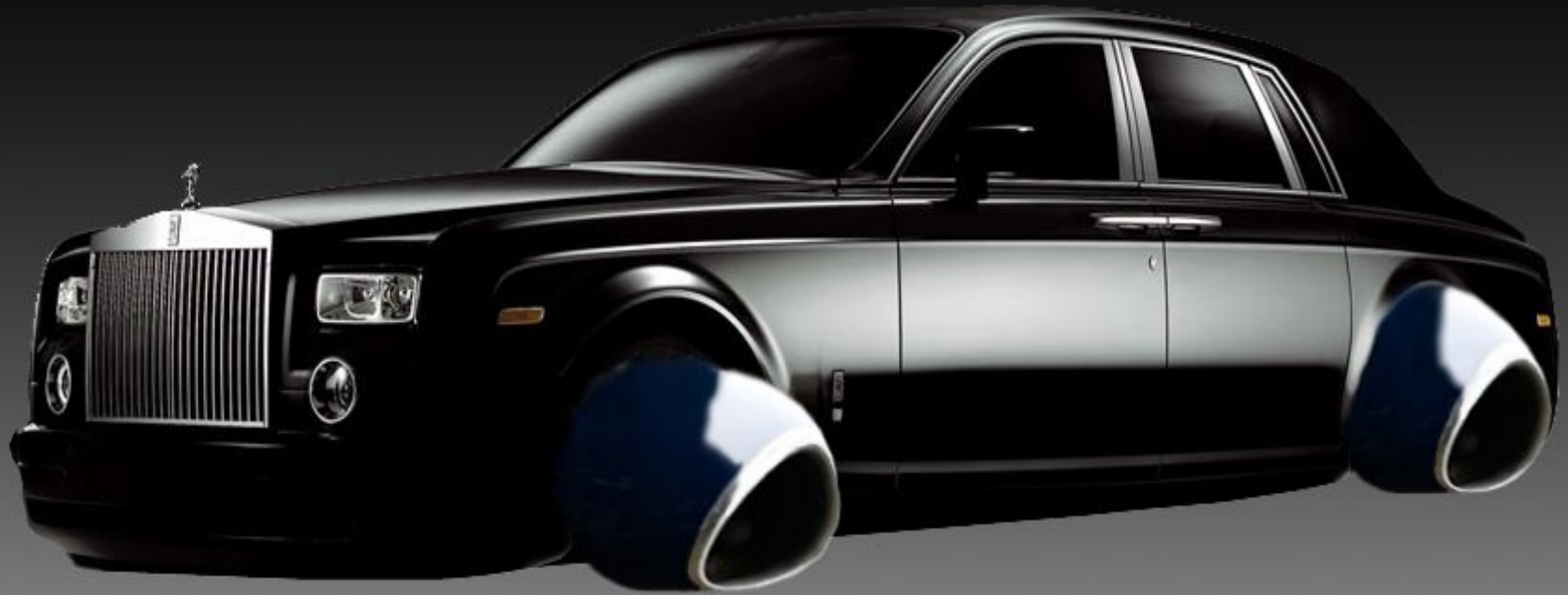
Model Eagle F002

You can use Eagle flying car everywhere.