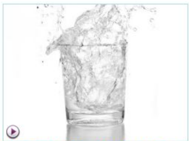
Do You Need 8 Glasses Of Water A Day?