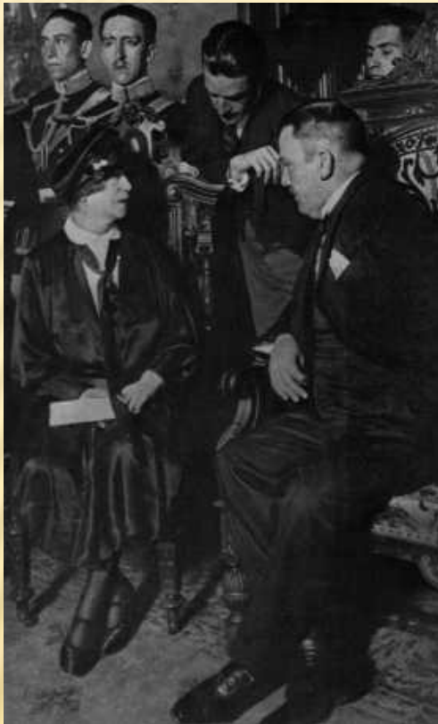
1926: Witt Mexico President Elias Calles