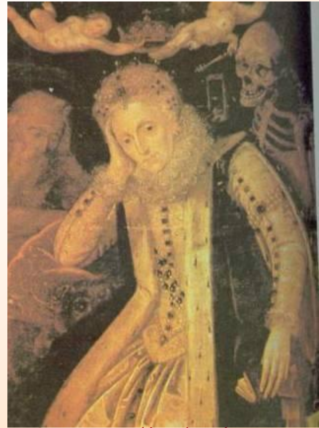
«Queen Elizabeth. Time and death». 1600

«All the mechanism of my rule is in breaking » – from the letter of Elizabeth I to Henry IV, the King of France.