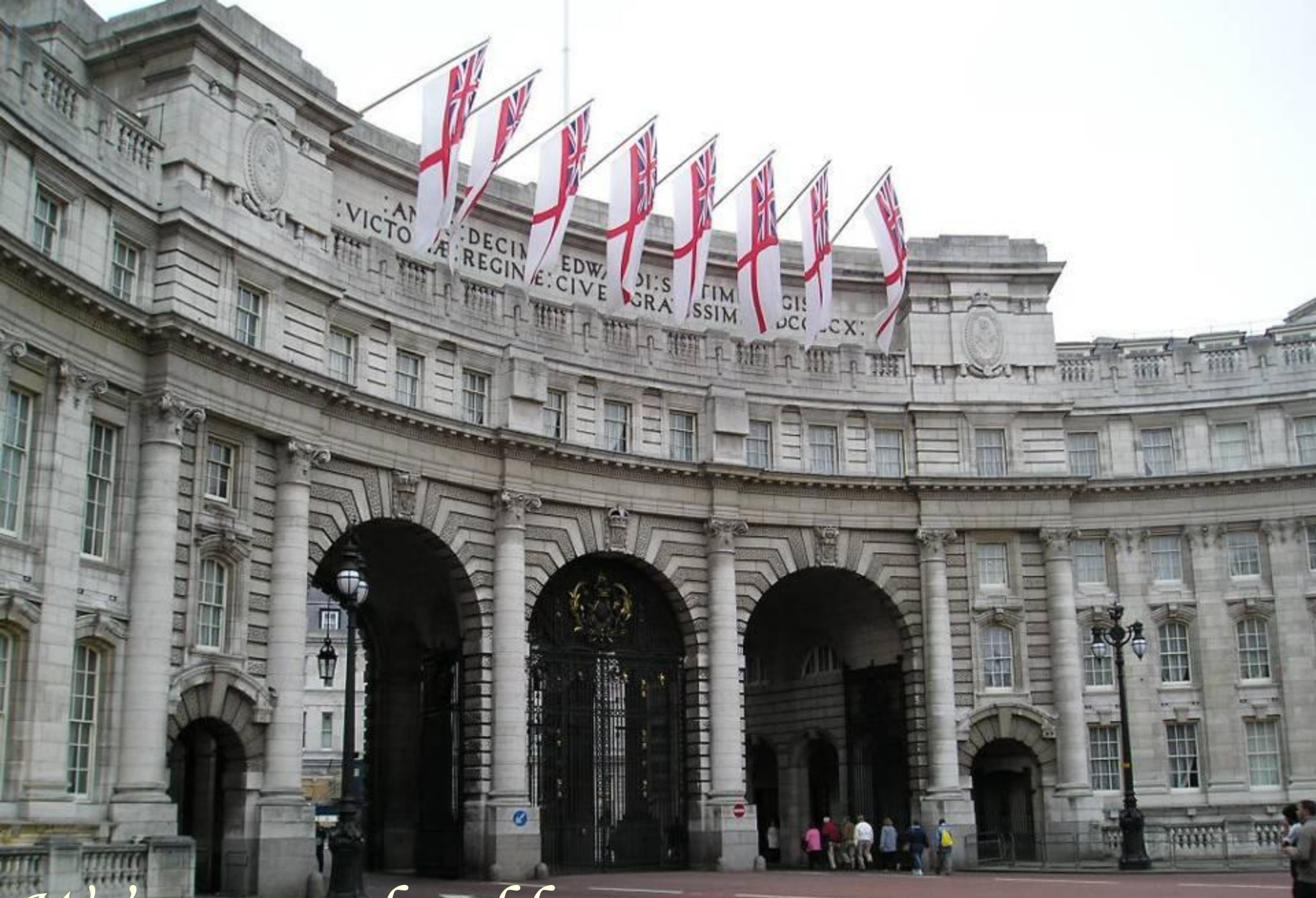
We've seen the old...