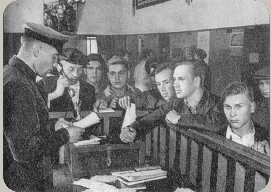
The first day of mobilization in Oktyabrski region of Tambov.

Tambov region had a large mobilization potential. In the first days of the war the military commissioners received numerous applications from volunteers to send them to the front. With the help of the Communists and Komsomol members the communist battalion was formed which consisted of 500 people and it was sent to the Byelorussian Front. Most of the warriors of the battalion were killed, but at the cost of their lives, they stopped the enemy at his front.