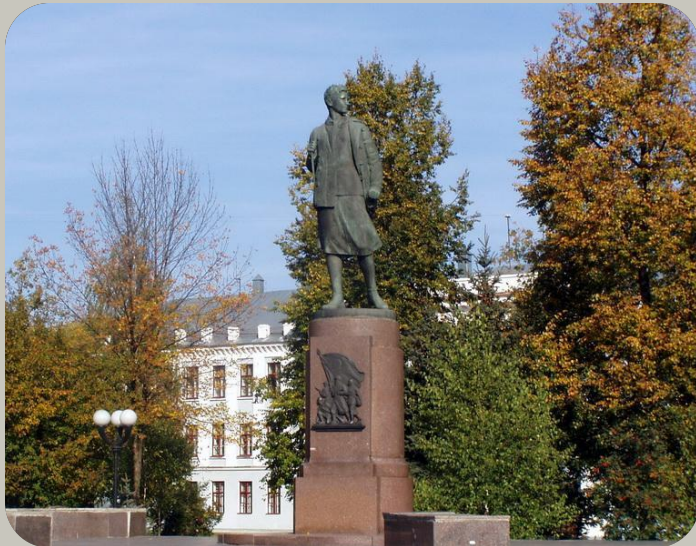
The monument of Zoya Kosmodemyanskaya, the hero of the Soviet Union

Tambov people fought on all fronts, both in the regular Red Army units and in partisan detachments in the temporarily-occupied territory, in the Resistance movement in Italy, France, Belgium. More than 260 Tambov warriors were awarded the title Hero of the Soviet Union. Full Cavalier of the Order of Glory was given more than 50 people.