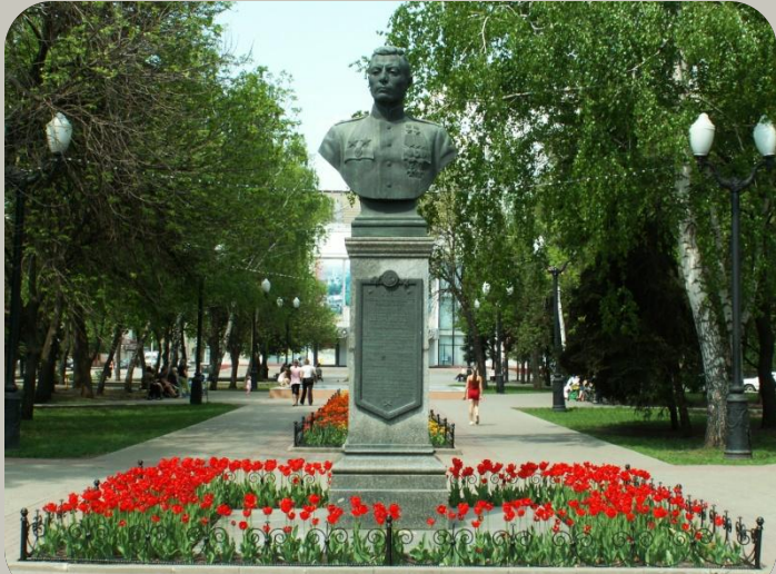
The monument of Petrov V.S., the hero of the Soviet Union