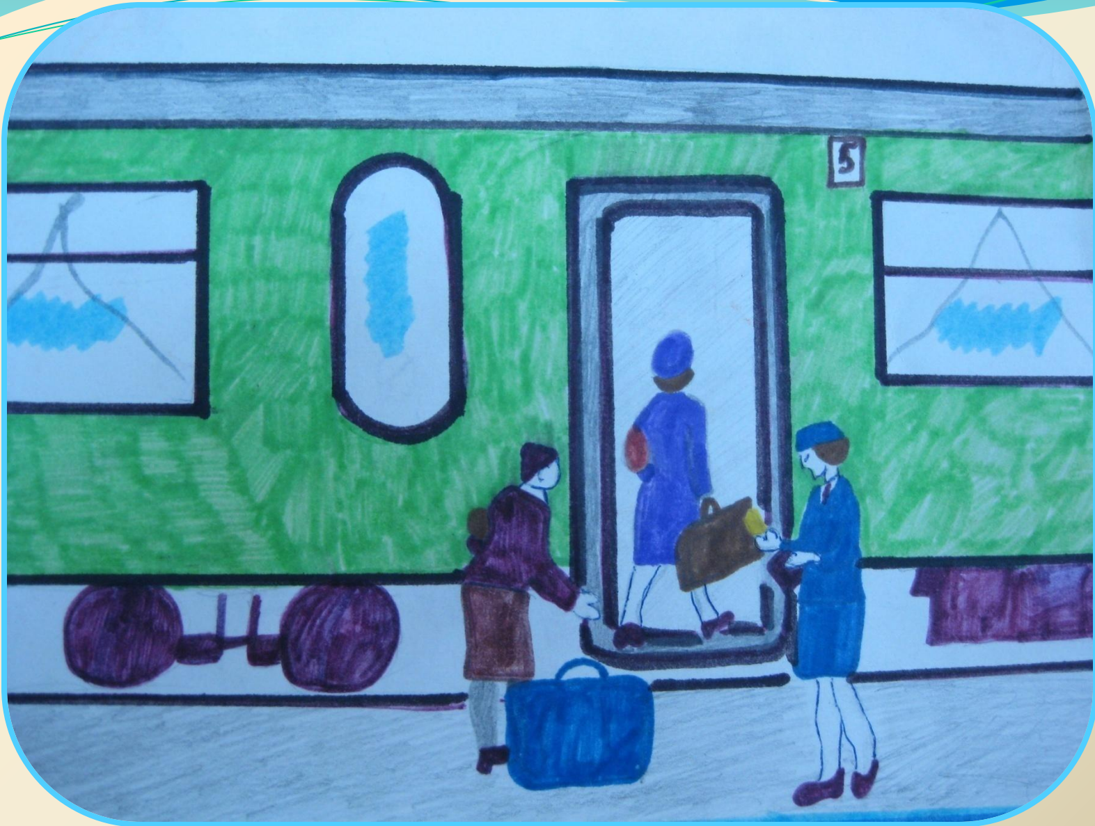
During the stops other passengers can get on the train.