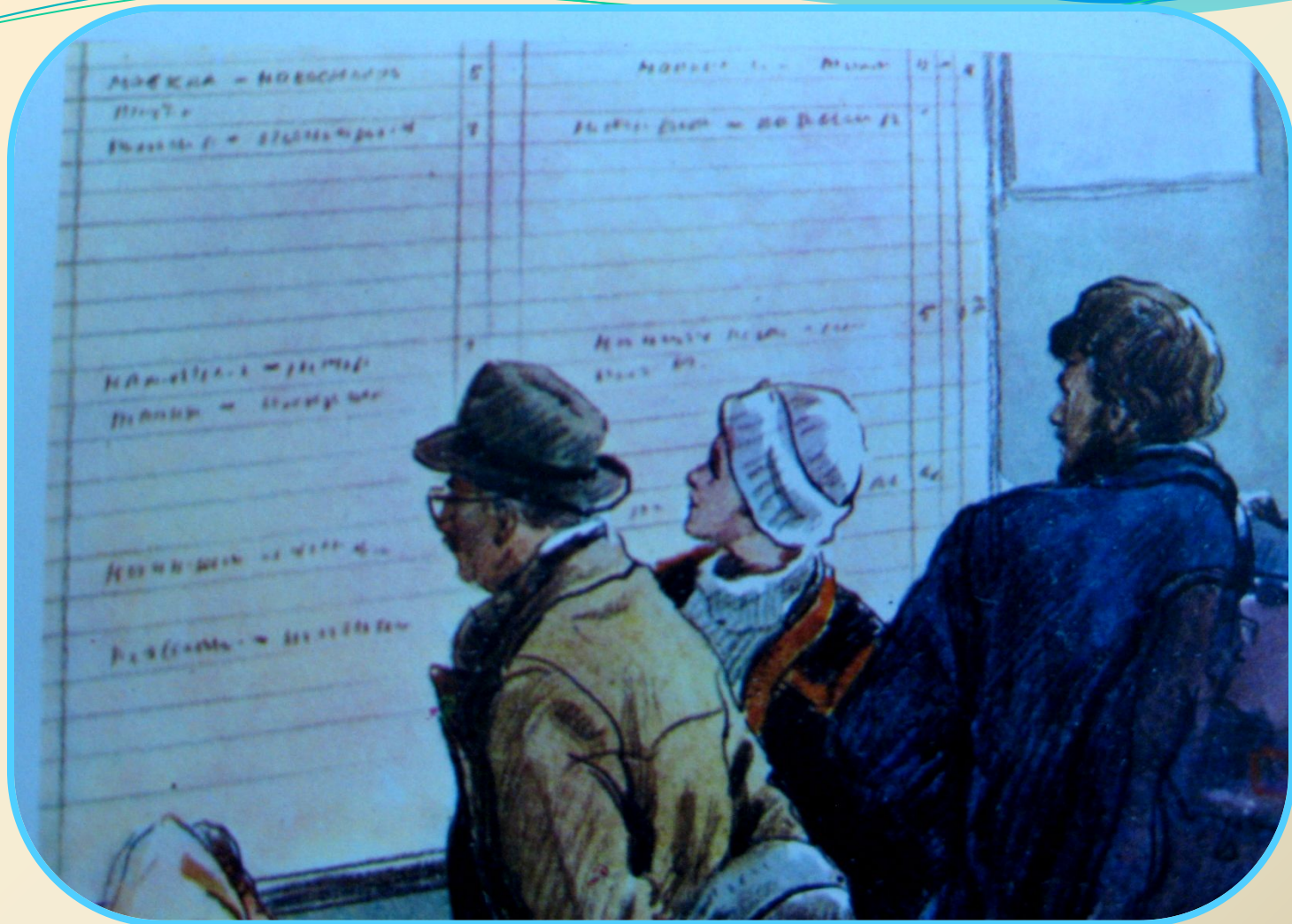
People can look at the time-table of the trains.