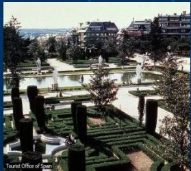
Tourist Office of Spain