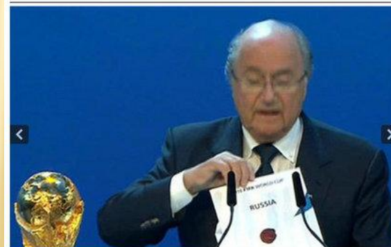
GALLERY: DECISION TIME Decision time in Zurich

Russia wins World Cup bid as English contingent headed by David Cameron and Prince William defeated.