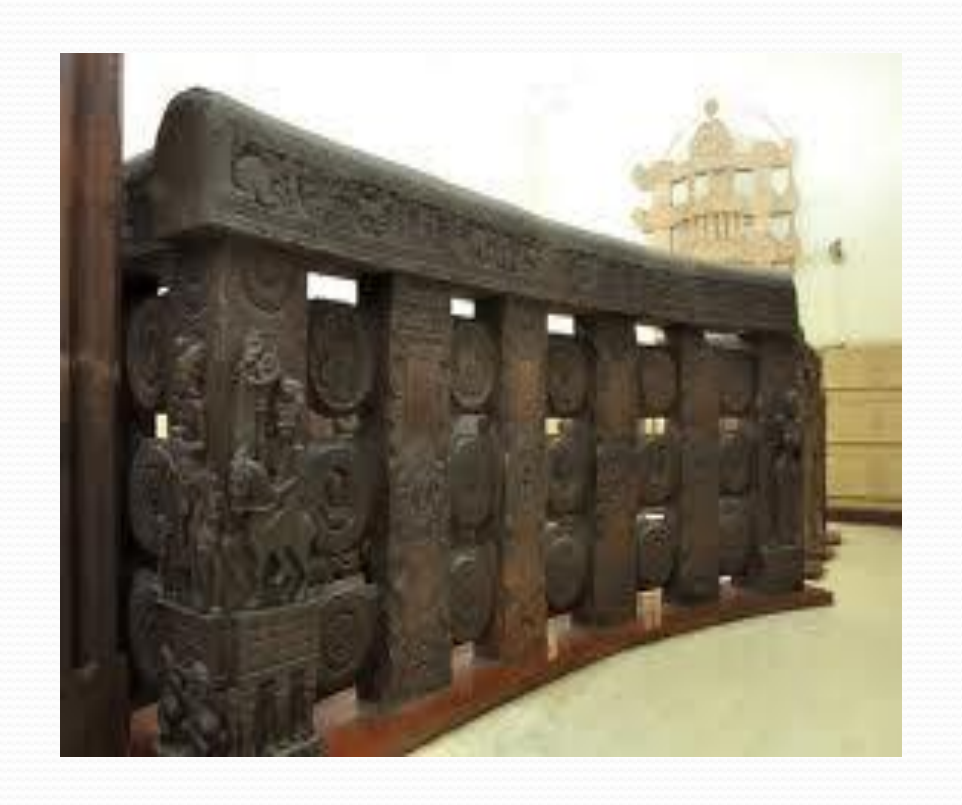
Panel from Buddhist Stupa

The ash remains of Lord Buddha is one of the valued assets of the Indian Museum.