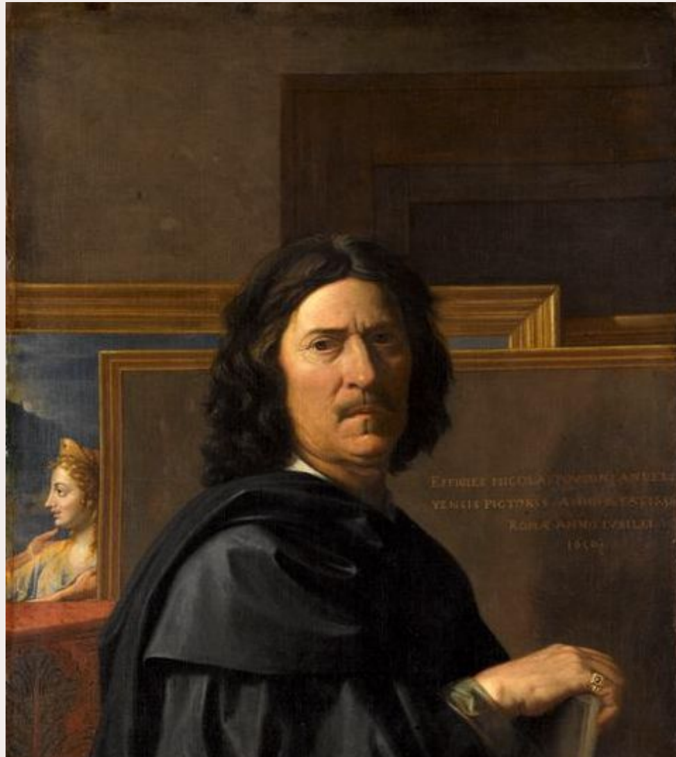
NICOLAS POUSSIN (1594-1665)