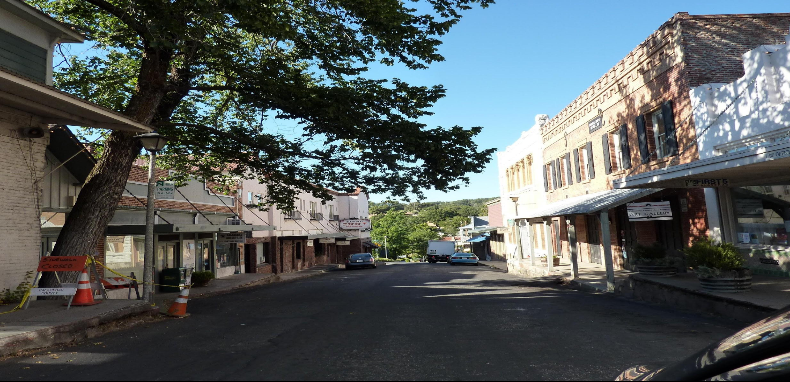
California Historical Landmark No. 252