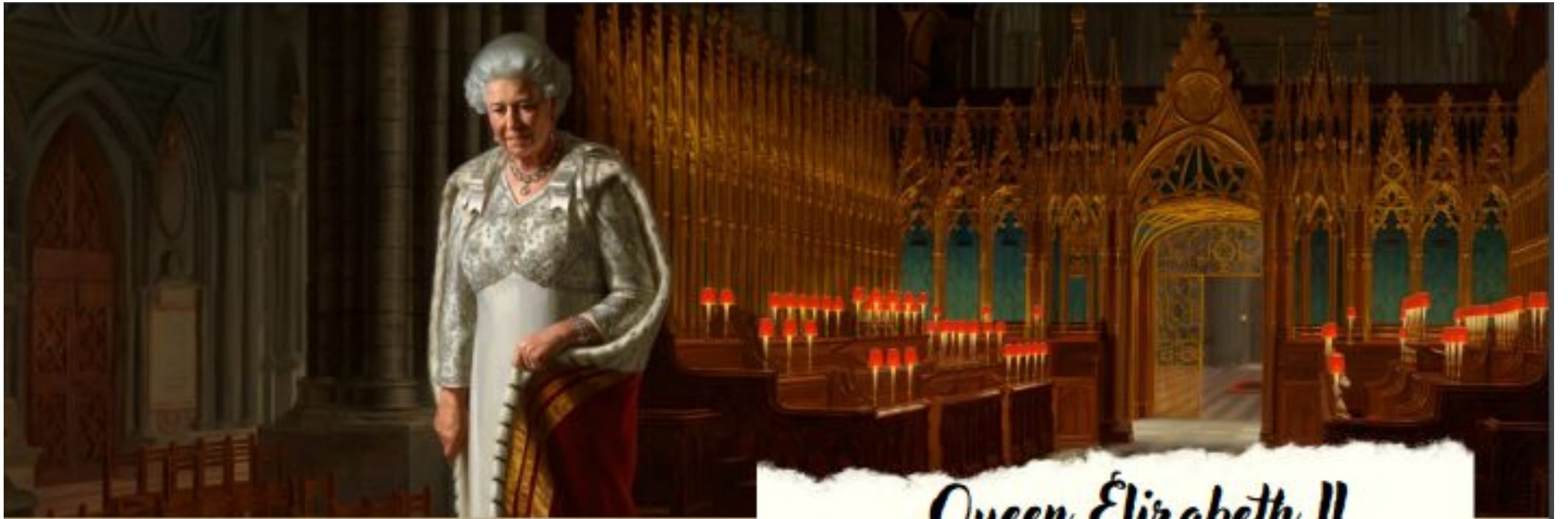
Queen Elizabeth II (1926-2022)