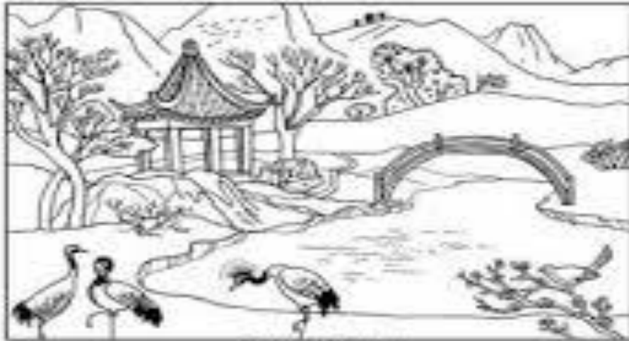
Find the differences