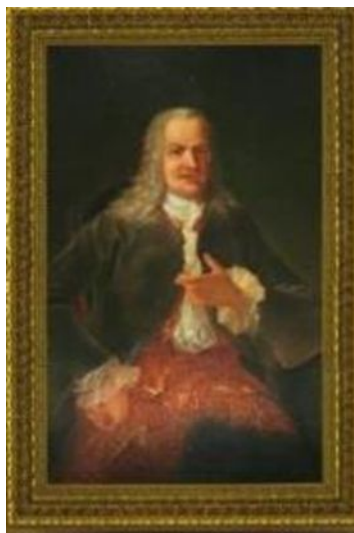
Akinfiy Nikitich Demidov(1678 - 1745)