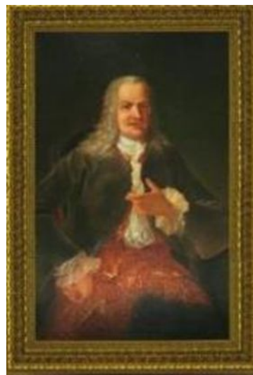
Akinfiy Nikitich Demidov(1678 - 1745)