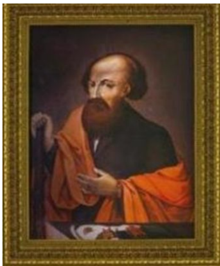
Nikita Demidovich Antyufeev(Demidov)( 1656 - 1725)