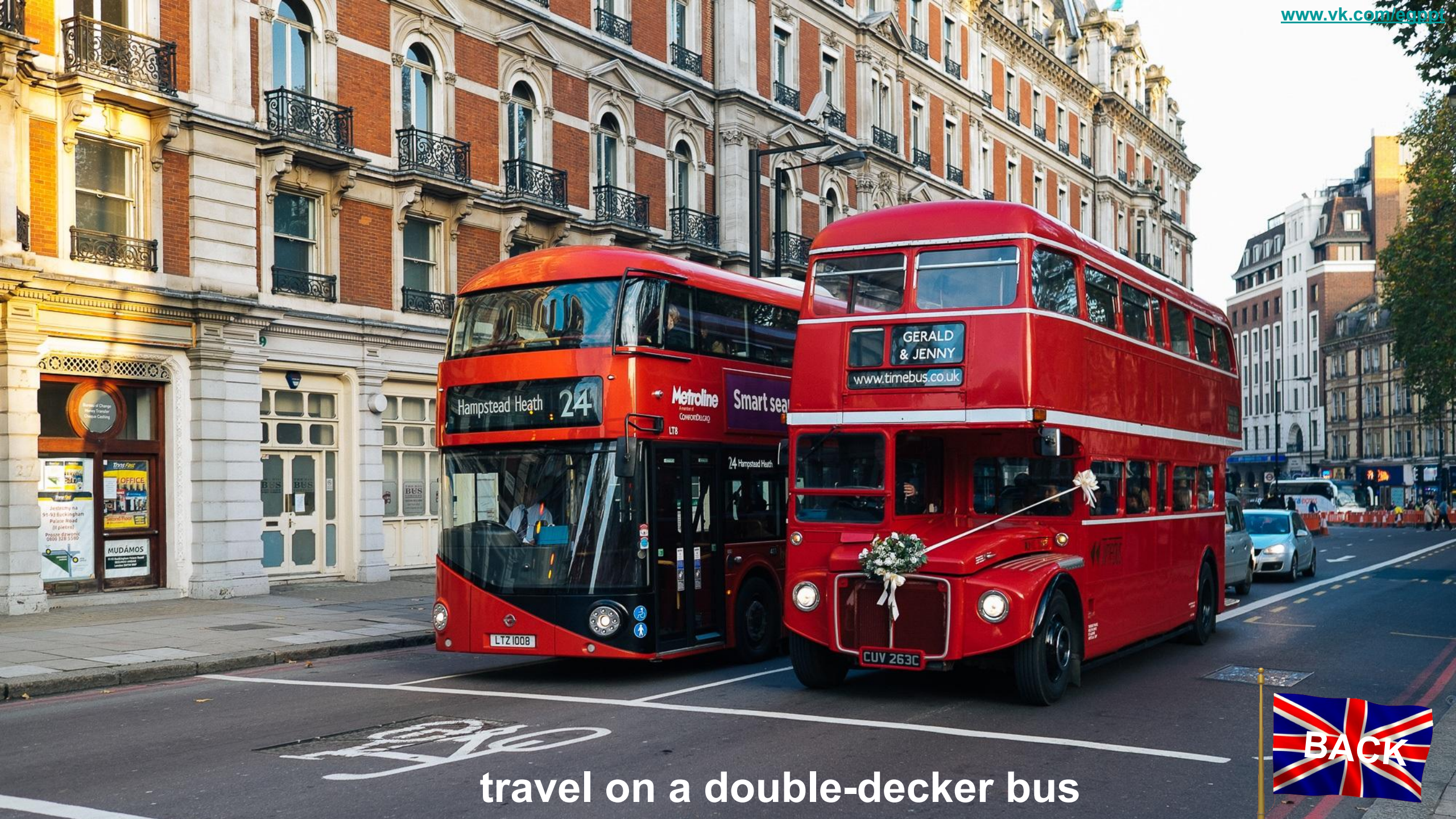
travel on a double-decker bus