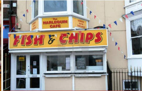
fish and chip shop