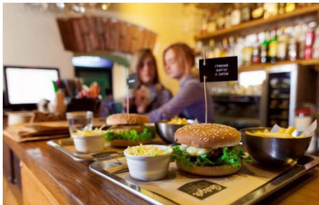
fast food restaurant

If you want to eat, where will you go? What will you buy?