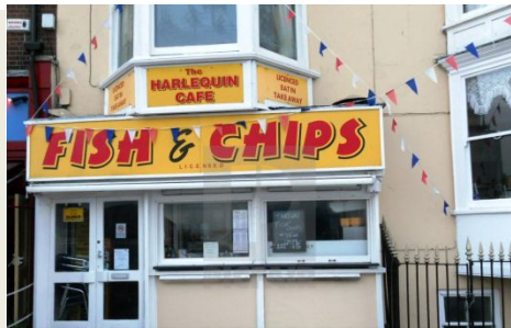
fish and chip shop