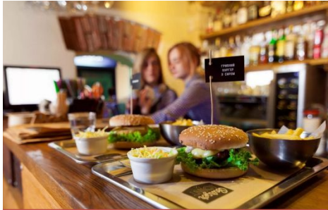
fast food restaurant

If you want to eat, where will you go? What will you buy?