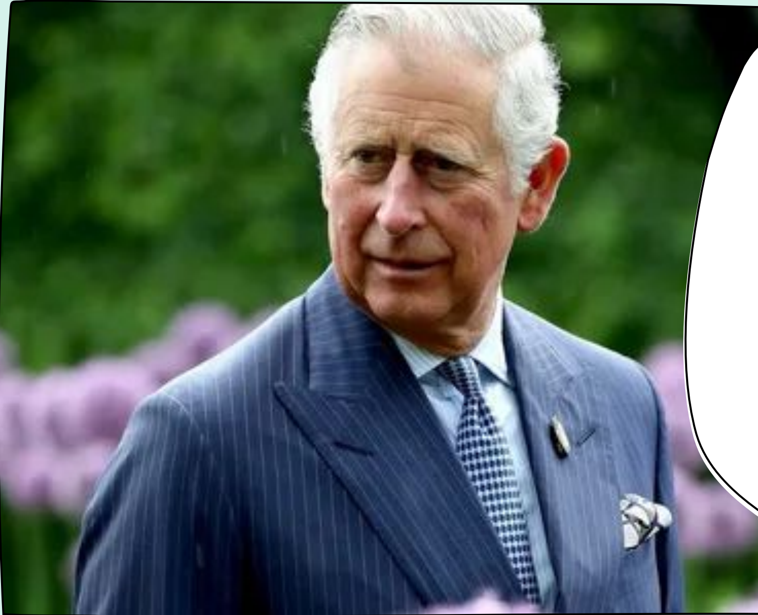
Charles III 2022 -...

Following the death of Queen Elizabeth II, Charles succeeded to throne at the age of 73, taking the title King Charles III, his wife Camilla becoming Queen Consort. Charles is the oldest heir apparent to succeed to the British throne. Charles Philip Arthur George was