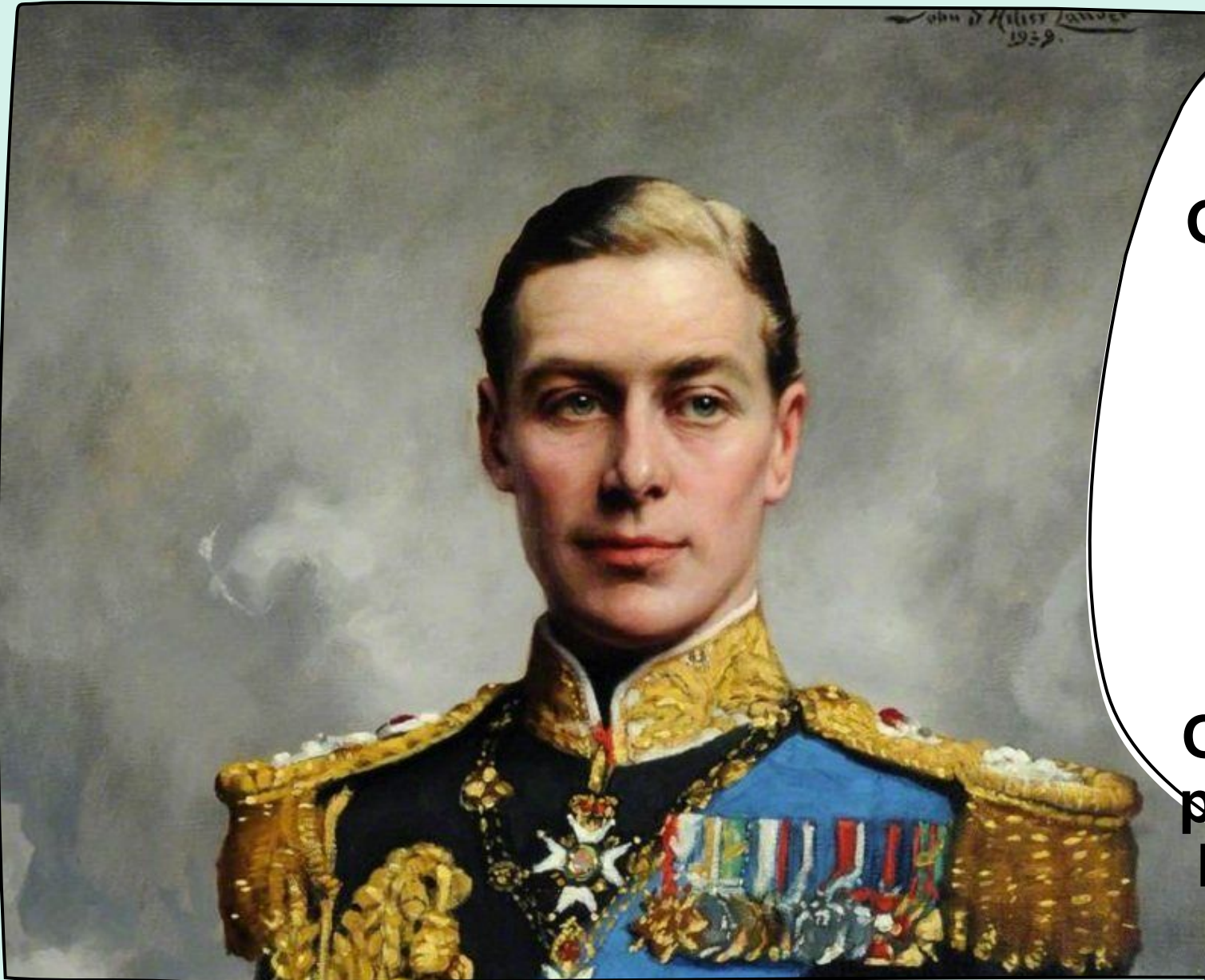
GEORGE VI 1936-1952

George was a shy and nervous man with a very bad stutter , the exact opposite of his brother the Duke of Windsor, but he had inherited the steady virtues of his father George V. He was very popular and well loved by the British people. The prestige of the throne was low when he became king, but his