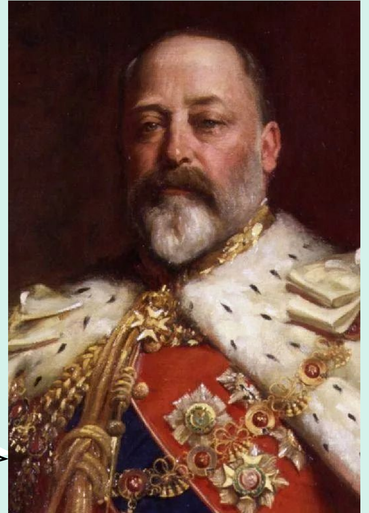
EDWARD VII 1901 – 1910

He loved horse-racing, gambling and women! This Edwardian Age was one of elegance. Edward had all the social graces and many sporting interests yachting