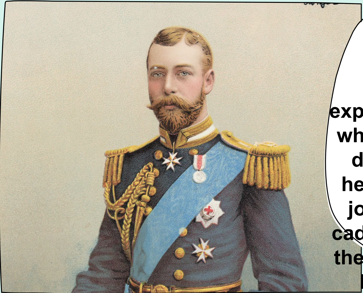
GEORGE V 1910 – 1936