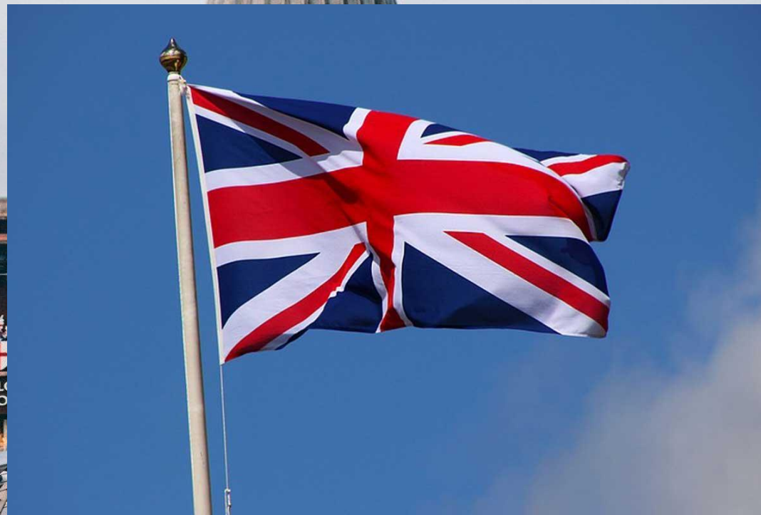
The Union Jack