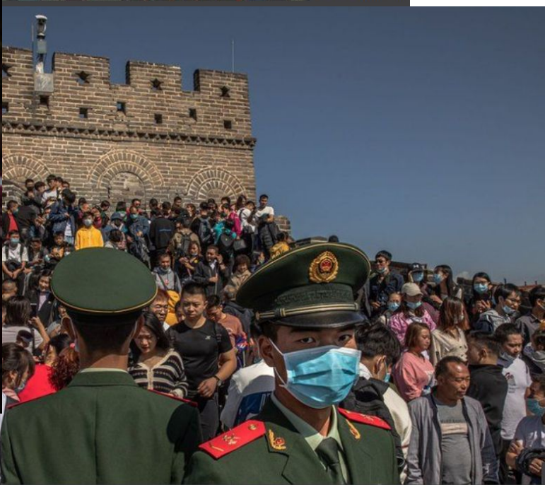
Scores of people are seen on the Great Wall of China