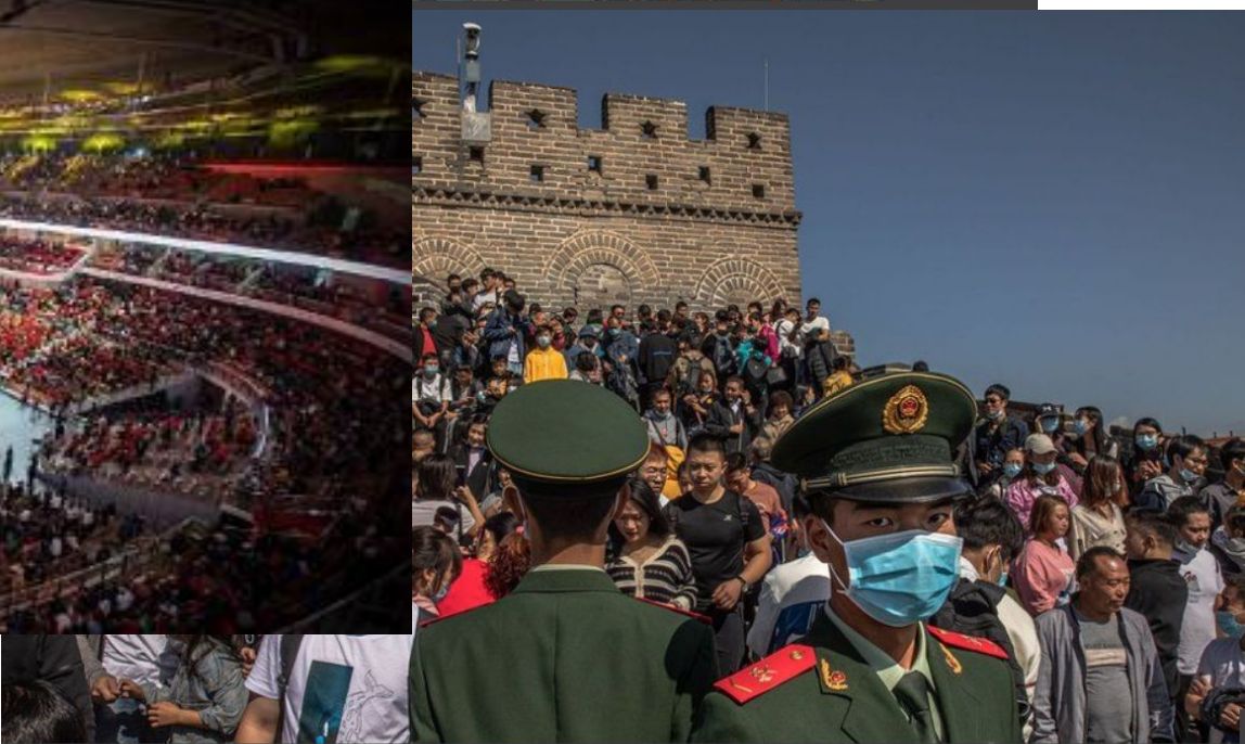
Scores of people are seen on the Great Wall of China