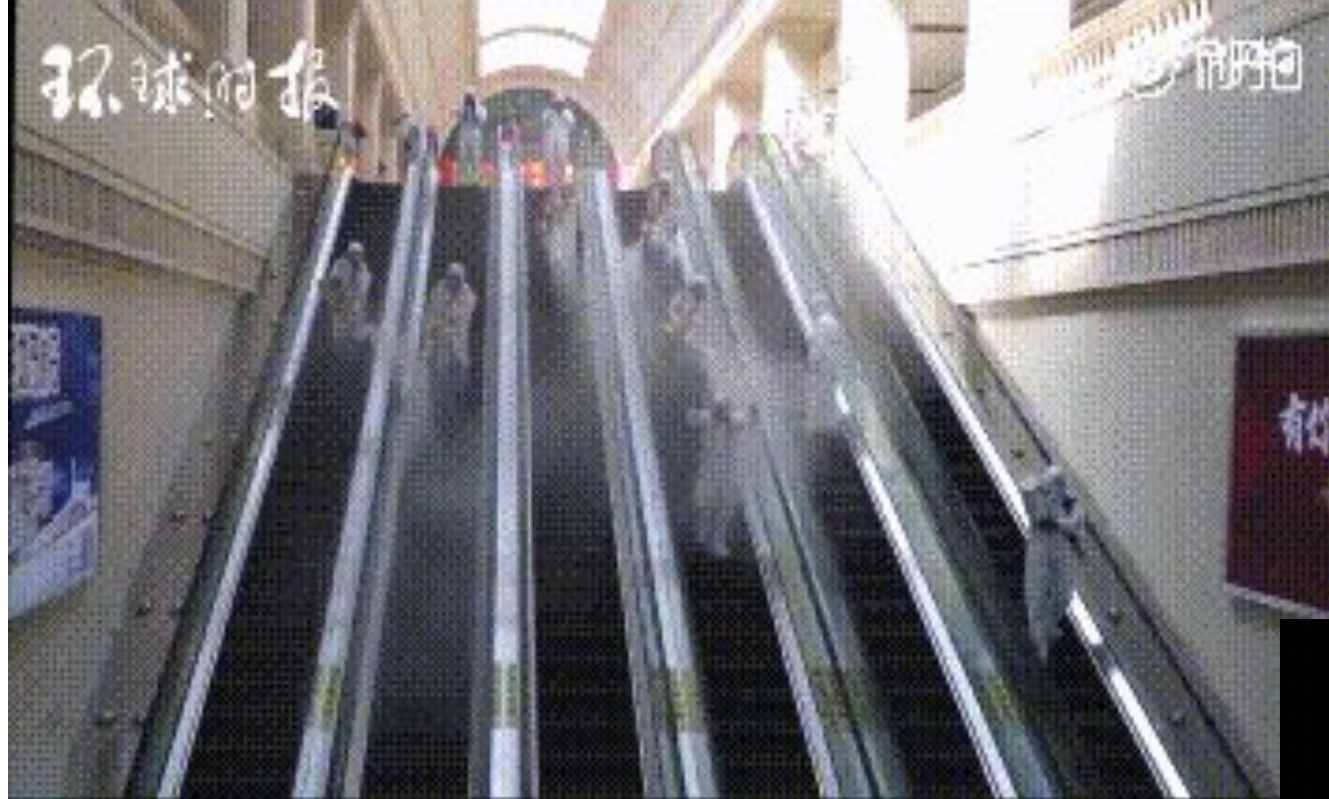
This was a complete disinfection at the train station in Wuhan during the Wuhan blockade.

On April 8, Wuhan was unblocked. As China controls the virus, people are gradually walking out of their homes. People will still get used to wearing masks.