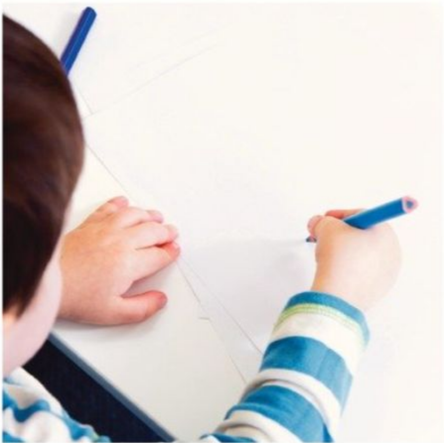
This pencil is blue.