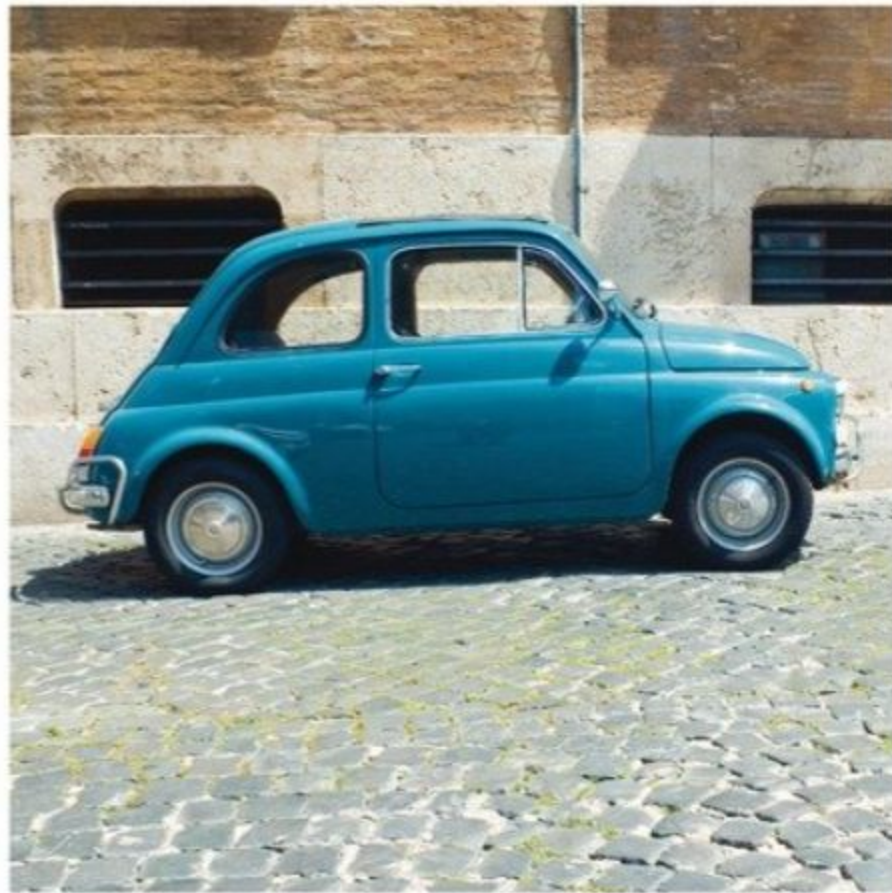
This car is blue.