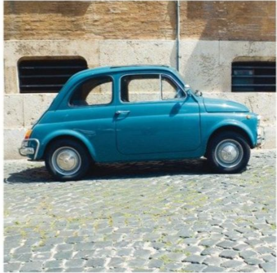
This car is blue.