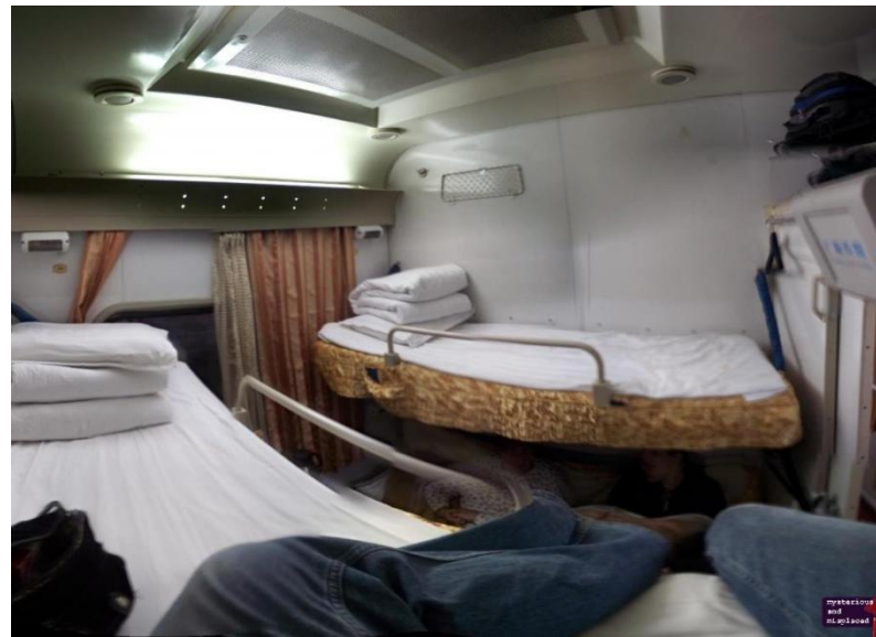
A sleeping car