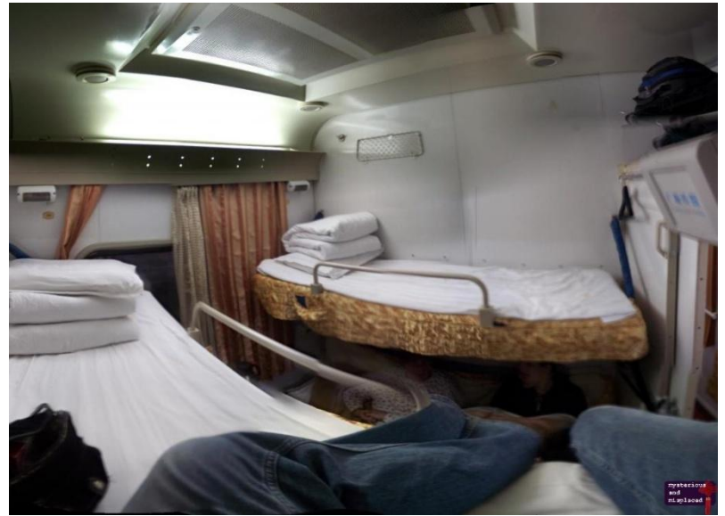
A sleeping car