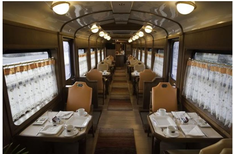
A dining car