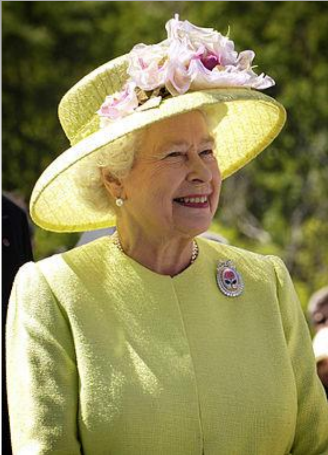
Королева Великобритании правит с 1952 года по настоящее время.