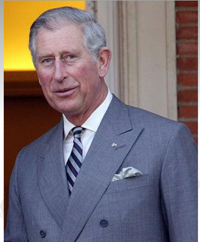
Чарльз, принц Уэльский Charles, Prince of Wales