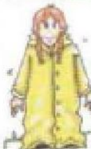
F wearing a mac