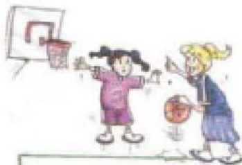
C playing basketball