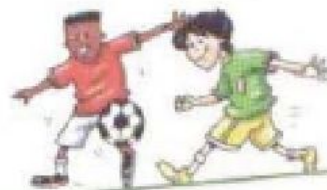
A playing soccer

1 What are they doing? Listen and match.