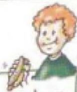
B eating a hot dog