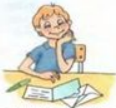
2 Dan (write) a postcard to his friend.