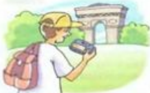
6 The tourist (take) a photo of the monument.