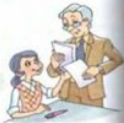
4 Mary (finish) the test.