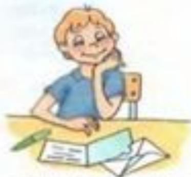
2 Dan (write) a postcard to his friend.