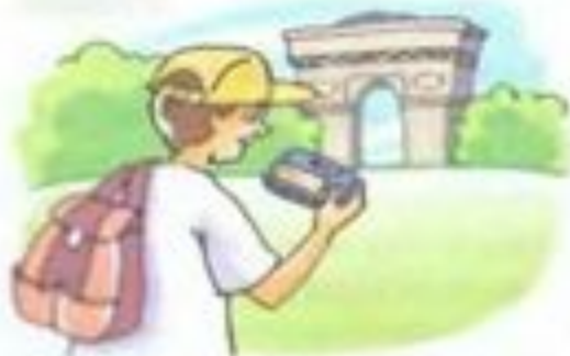
6 The tourist (take) a photo of the monument.