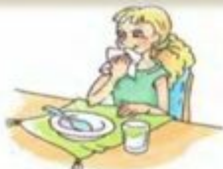
1 Susan (have) breakfast.

Example: 1. Susan has just had her breakfast.