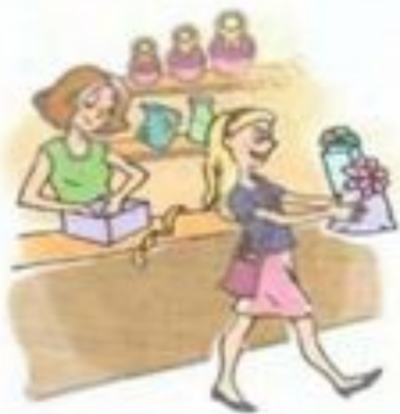
5 Alice (buy) some souvenirs.