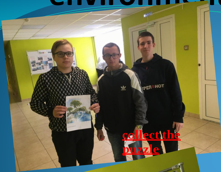
collect the puzzle