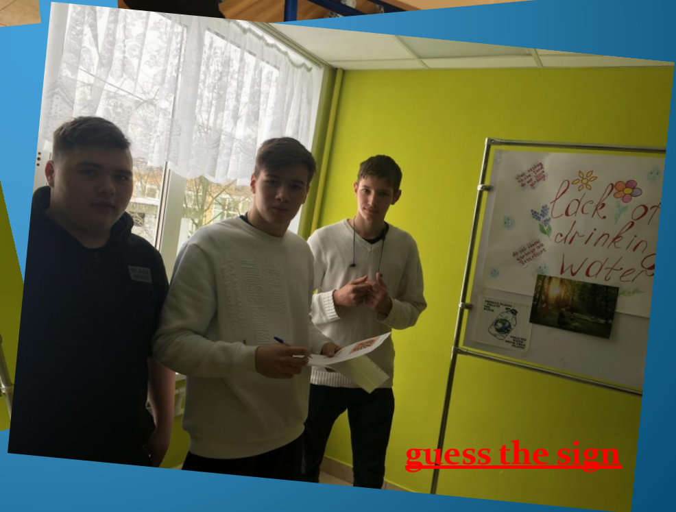
guess the sign