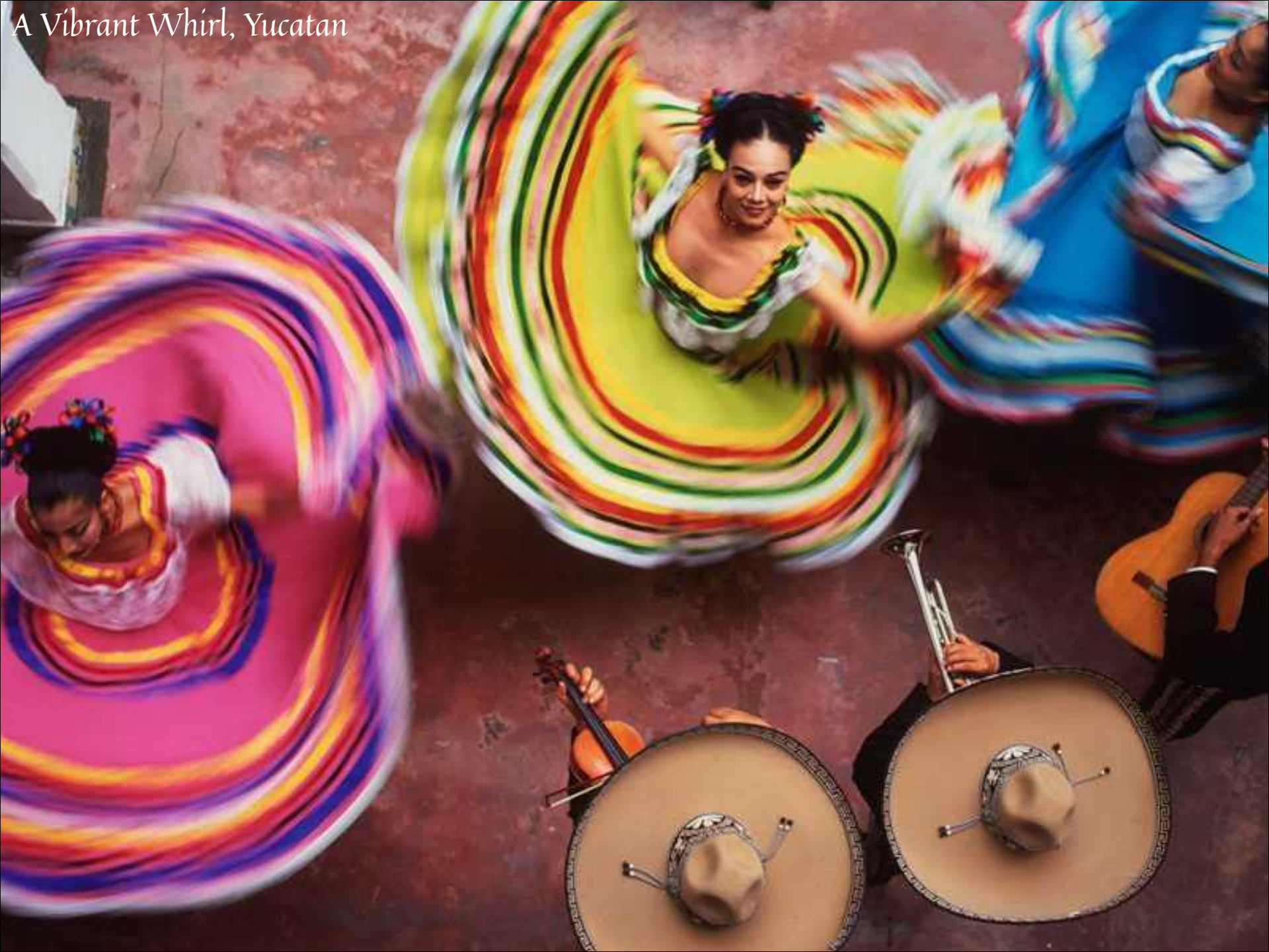
A Vibrant Whirl, Yucatan