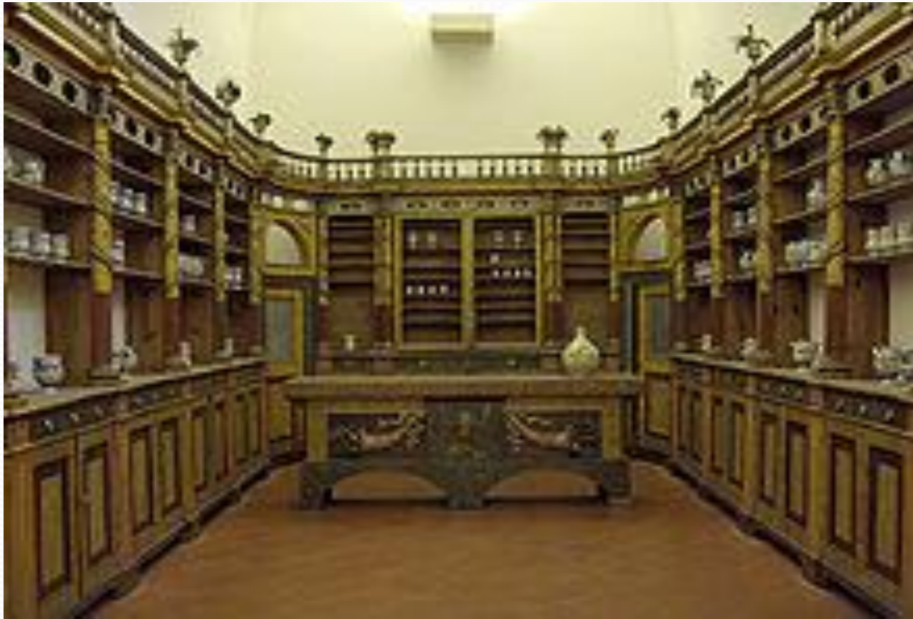
19th-century Italian pharmacy